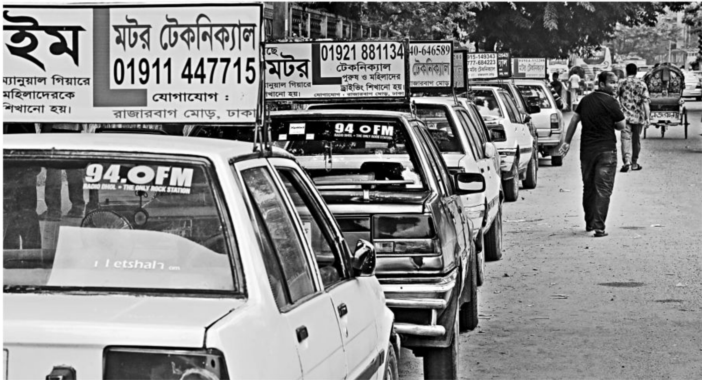
Cars of different driving schools have occupied a section of the road in front of Motijheel Government Boys High School in the capital. Parking like this has blocked almost one-third of the road, but the authorities concerned turn a blind eye. Such illegal practice is one of the major causes of traffic jams in the city. The photo was taken yesterday.