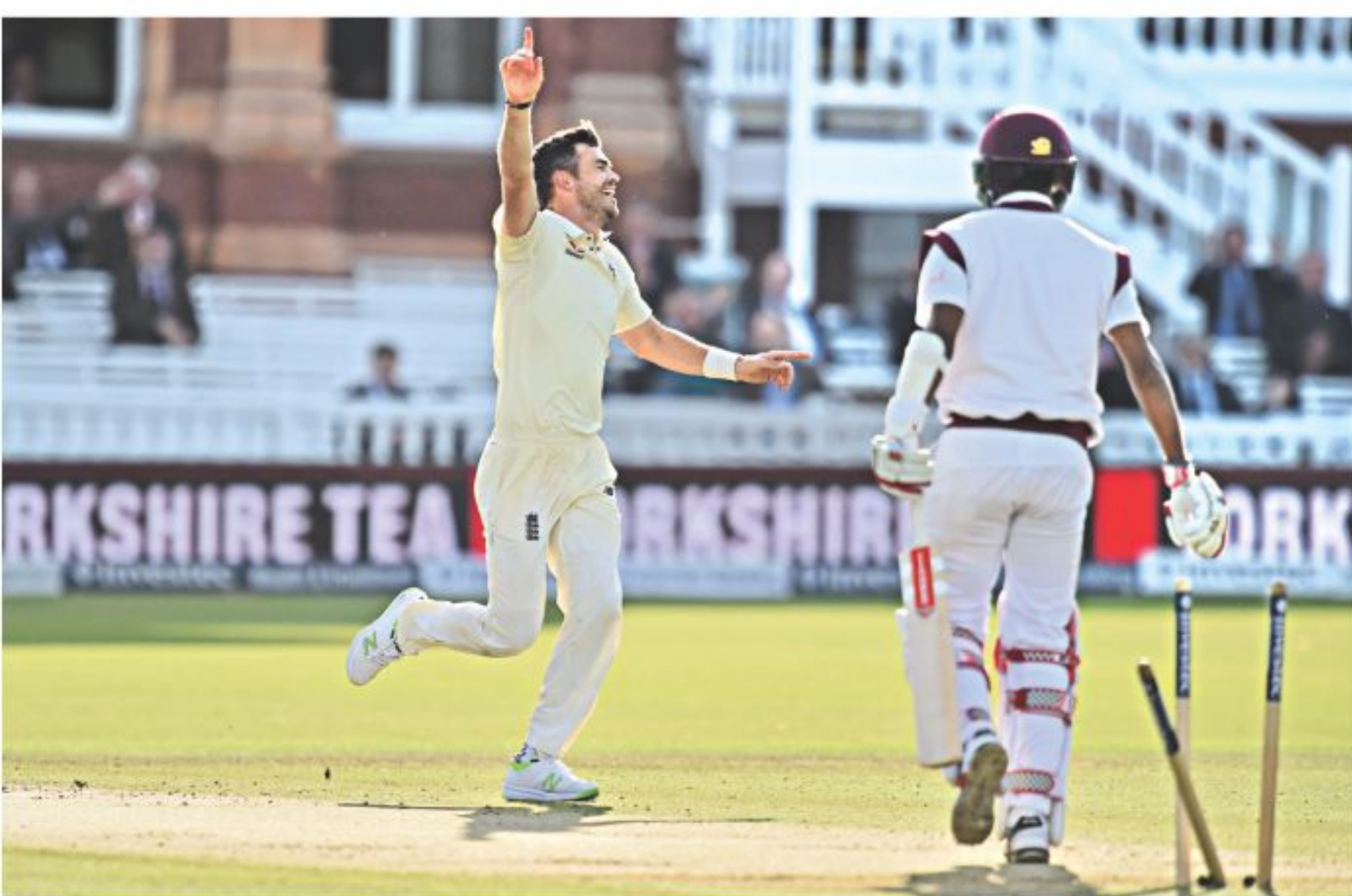
England's James Anderson joined an elite club when he bowled Kraigg Brathwaite for his 500th wicket on the second day of the third Test against West Indies at Lord's yesterday.