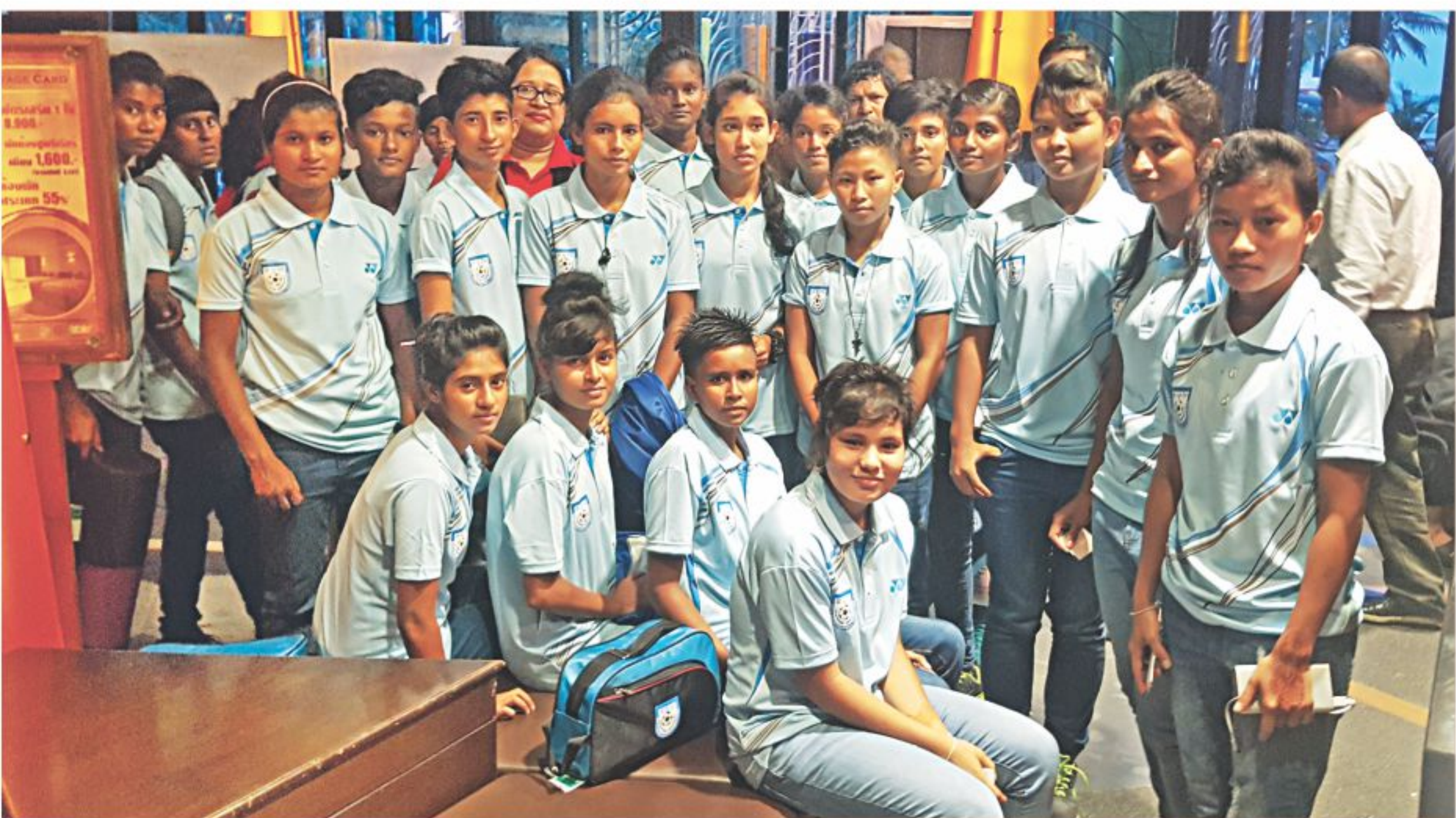
The Bangladesh U-16 women's football team pose for a group photograph after arriving at the Bangsae Heritage Hotel in Chonburi, Thailand on Friday. The team will begin their AFC U-16 Women's Championship finals campaign on Monday when they take on defending champions North Korea. The other teams in Group B are Australia and Japan while Group A features South Korea, China, Thailand and Laos.