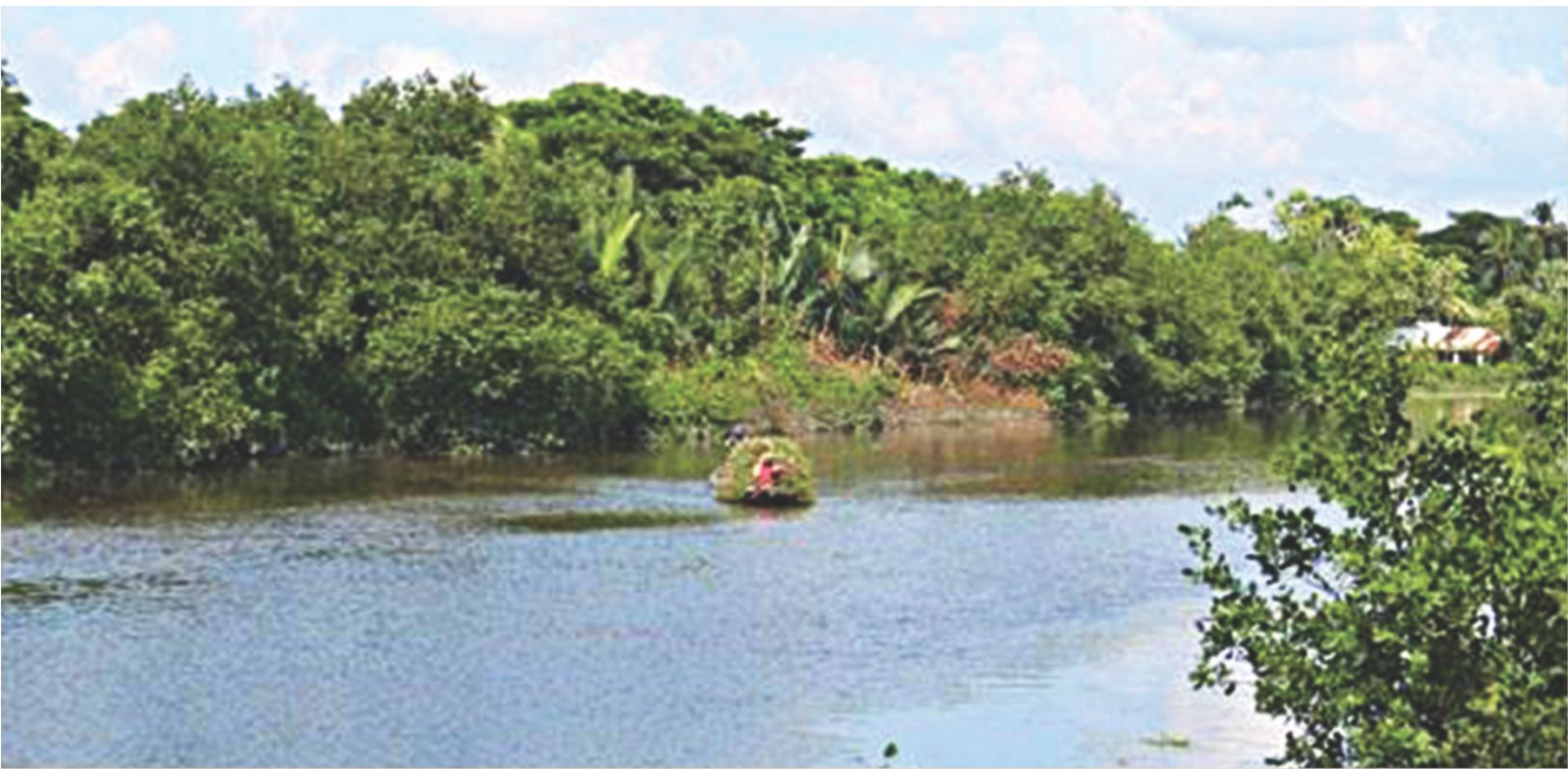
Picturesque naturally grown forest on the Chitra river in Chitalmari upazila of Bagerhat.