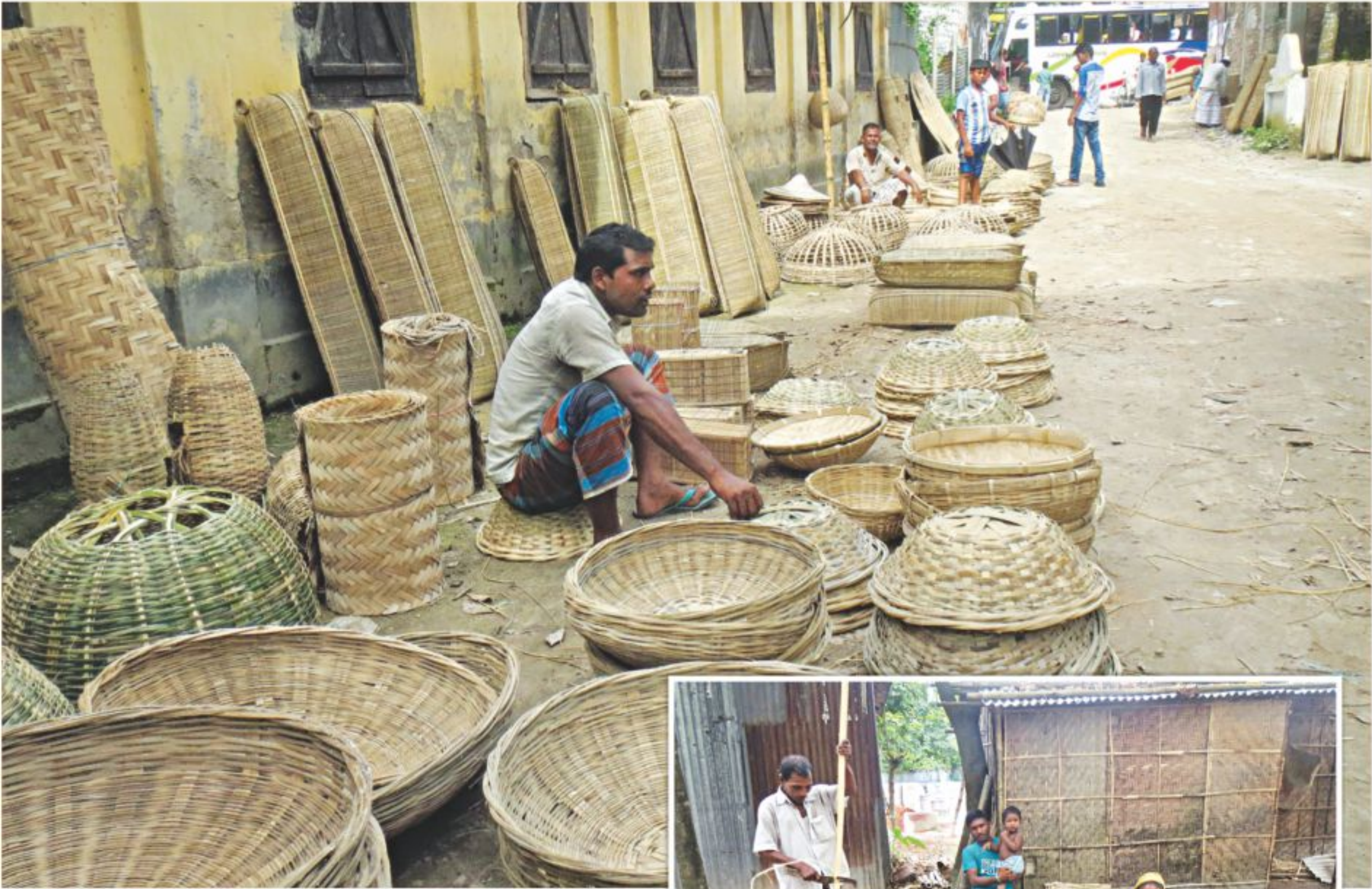
Sellers of bamboo items at Kathalbari Haat in Kurigram Sadar upazila pass idle time in absence of customers. Inset, artisans make household items with bamboo slats at Patnipara village in the upazila.

"The forest must be kept as a sanctuary for birds and other wildlife," says District Forest Officer Saidul Islam. "I will visit the area as soon as possible to take necessary steps to protect the forest." Bagerhat Deputy Commissioner Tapan Kumar Biswas says that all kinds of measures are being taken to increase awareness of the need to protect fauna. "If anybody is killing wild animals, stern action will be taken against them," he says.