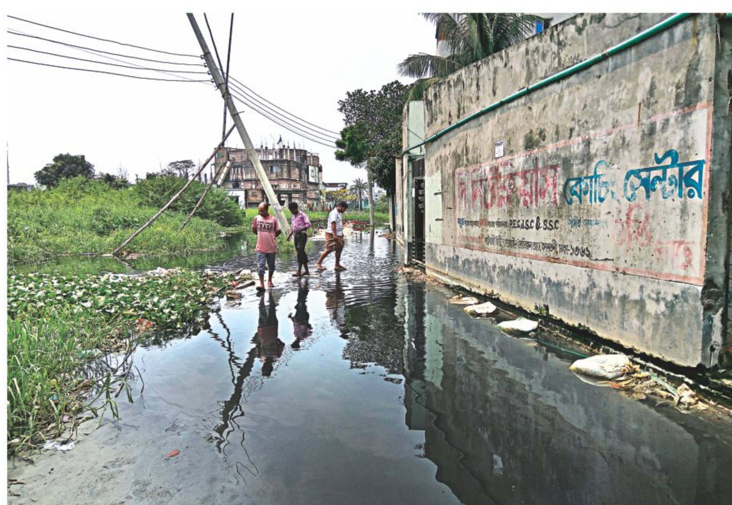
Shamimbagh area near Dhaka in Narayanganj has been waterlogged for three months. The photo was taken inside DND embankment area yesterday.