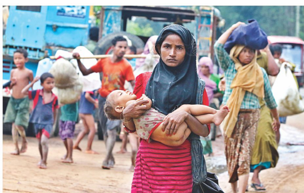
A Rohingya woman, who just crossed into Bangladesh, walks with her baby in search of shelter in Amtali area of Cox's Bazar's Ukhiya upazila.