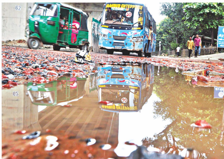
This road in Soloshahar area of Chittagong city is in a sorry state. Many paved thoroughfares of the port city have turned into gravel roads due to poor maintenance and waterlogging. This photo was taken yesterday.