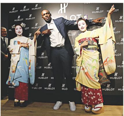
Jamaican sprint king Usain Bolt enjoyed his time in Kyoto and even entertained a couple of Japanese geishas into striking his trademark pose at a charity event yesterday.

After his 2009 triumph, he was to miss a total of 10 Grand Slam tournaments. At one stage last year, his world ranking, once as high as four in the world, slumped to 1,045 and he even considered retiring. Federer said he was happy to see the likeable Del Potro back on tour and the feeling is mutual. "I admire him, too. Everybody loves him," said Del Potro. "It's going to be an interesting match to play. It will be the first time after eight years again in the central court of this tournament." "I know how to play if I want to win, but always is a pleasure to play the greatest guy in history." Now the 28-year-old hopes to recover in time for the clash having needed to save two match points to defeat Dominic Thiem 1-6, 2-6, 6-1, 7-6 (7/1), 6-4 in the fourth round. He even admitted he had come close to quitting the match as a fever had left him with breathing difficulties. "I feel tired, but we cannot do magic," he said.