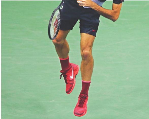
Roger Federer has a chance to avenge his 2009 final defeat after setting up a US Open quarterfinal clash against Juan Martin Del Potro scheduled for tonight.