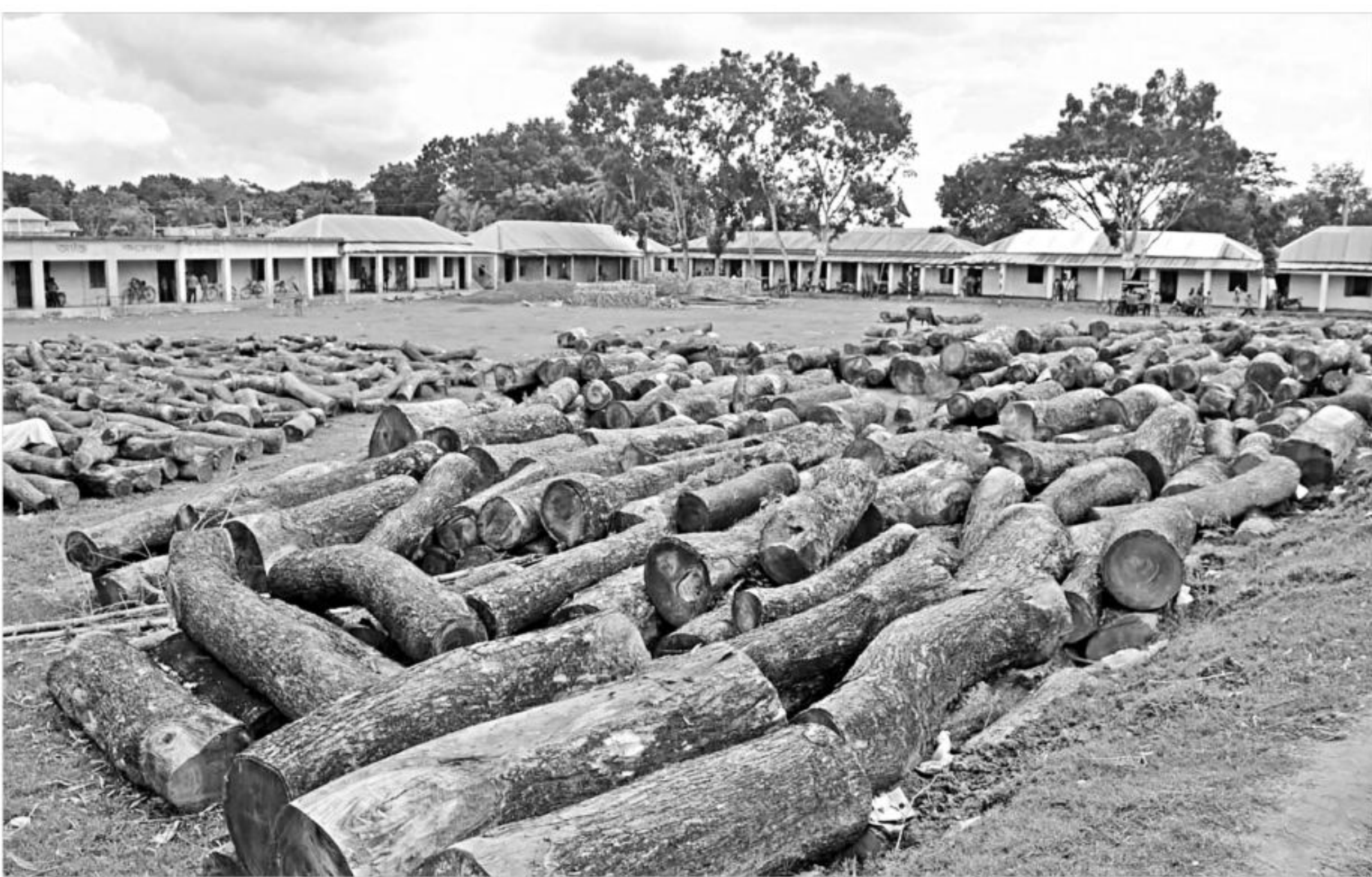
An influential person has kept huge logs on the playground of Kobi Jasimudddin School and College in Faridpur Sadar upazila for the last eight months, depriving the students of playing game.