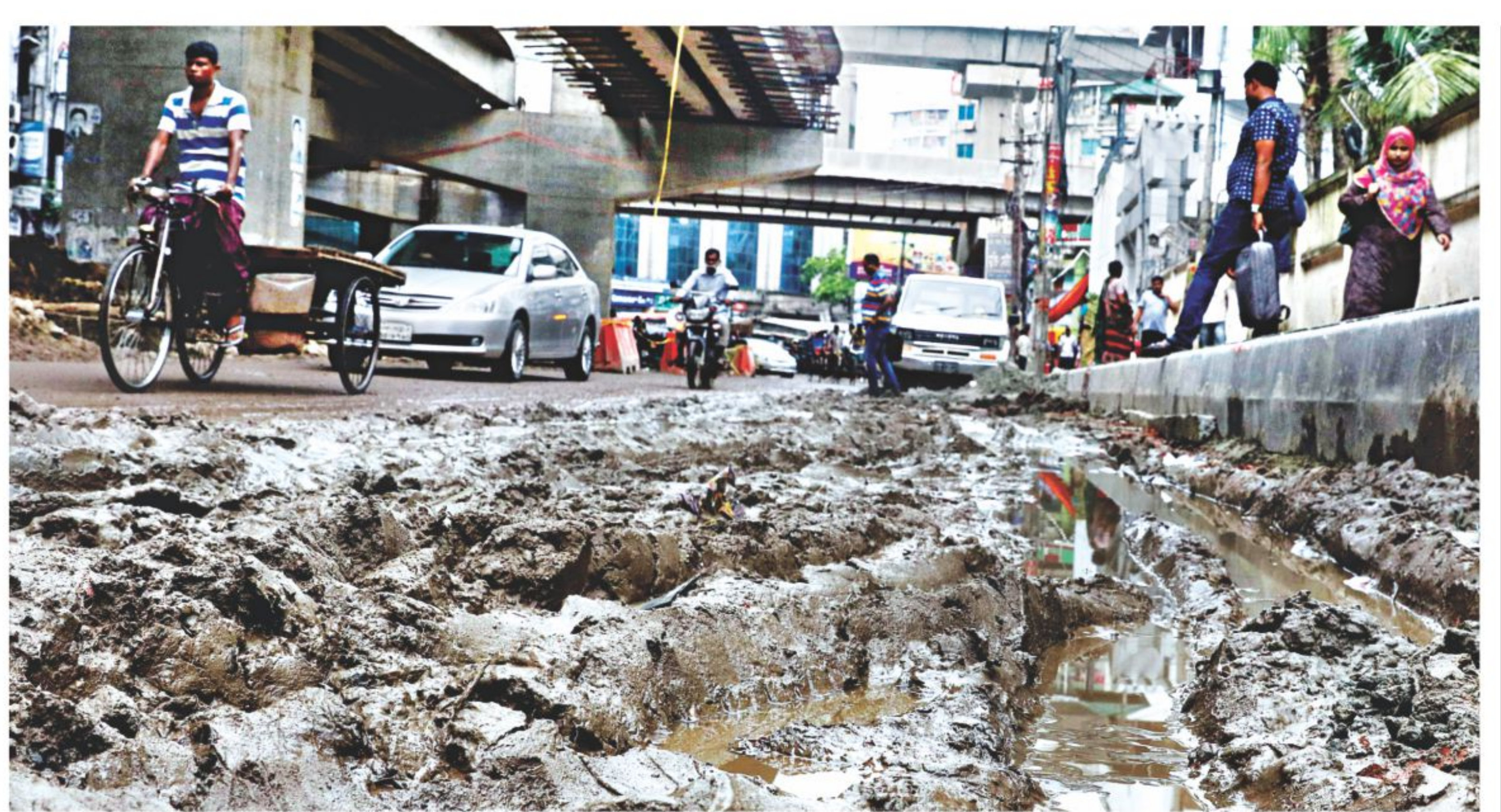
The damaged portion of this road hinders vehicular movement in the capital's Malibagh area. The road has been left unrepaired for a long time due to the work of Moghbazar-Mouchak flyover. The photo was taken recently.