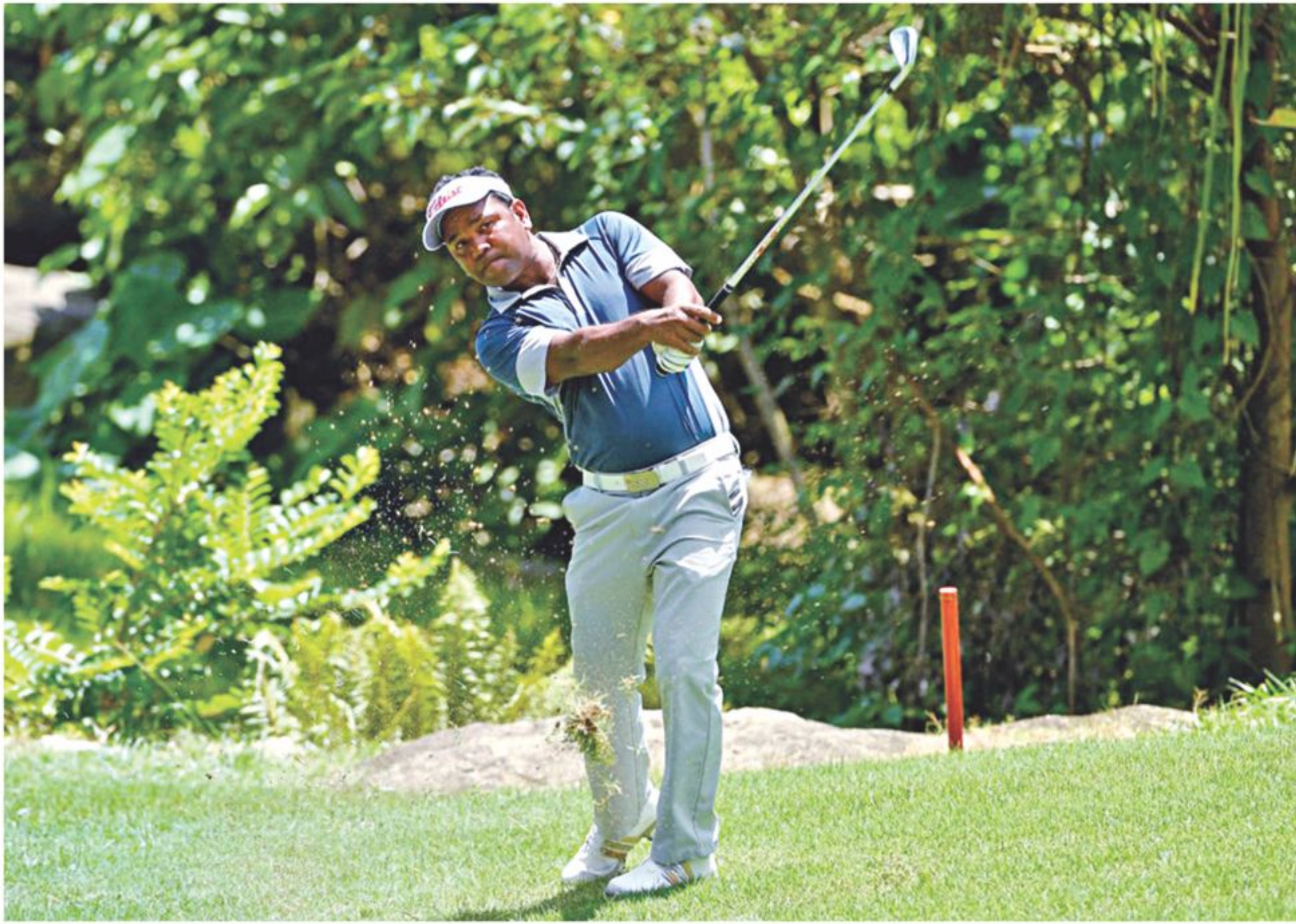
Bangladesh's premier golfer Siddikur Rahman had a flawless final day in Hamburg yesterday and finished with a flourish to tie for third place in the Porsche European Open.

The Bangladeshi golfer started the fourth round at the Green Eagle Golf Course in 10th position, five shots off the pace, as he returned a card of 73 following two excellent opening rounds (70, 66). The ground he lost in the third