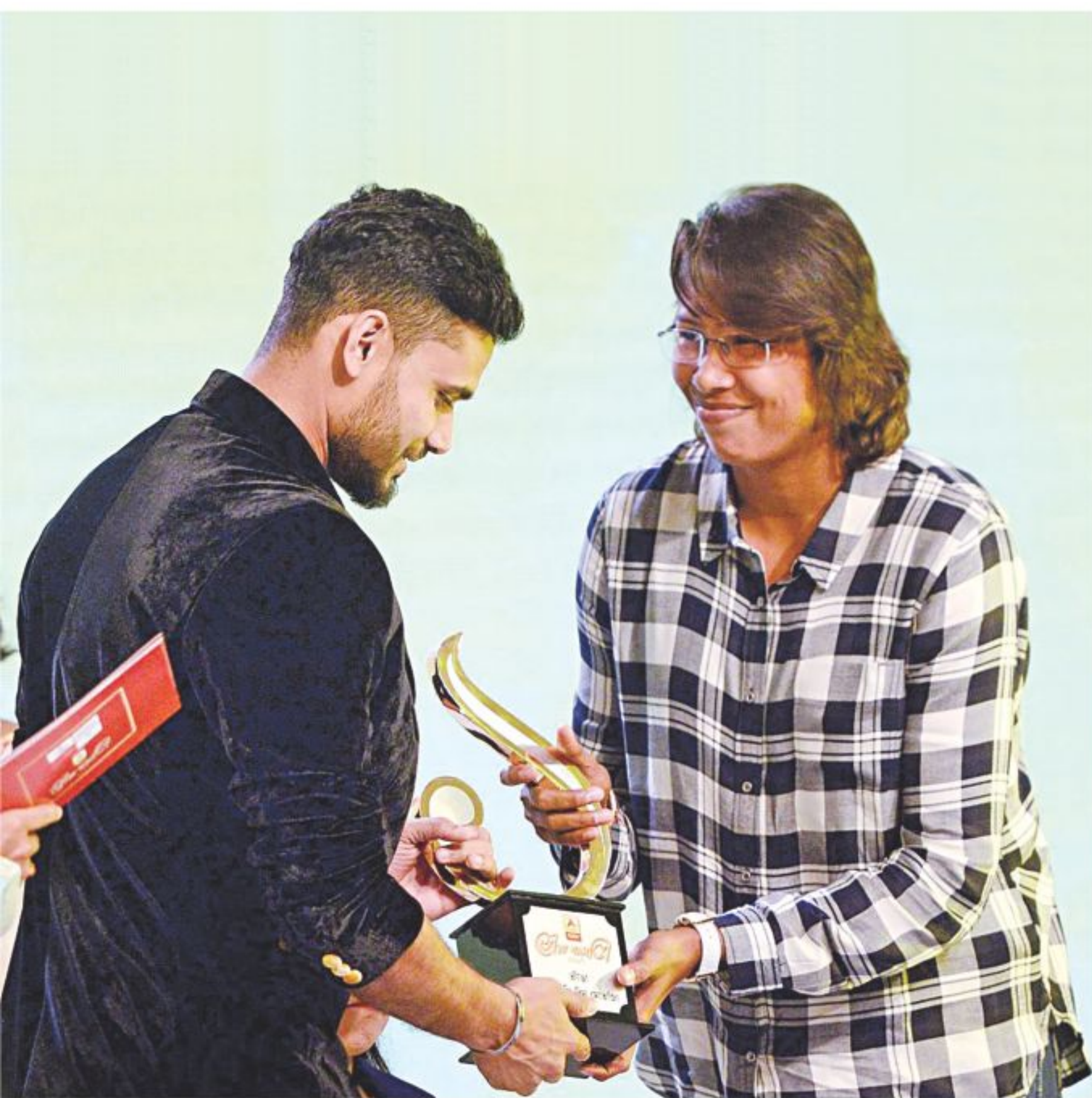
Inspirational Bangladesh captain Mashrafe Bin Mortaza (L) receives the 'Sera Bangali' award from Jhulan Goswami, a member of the India women's team, during an award ceremony at a posh Kolkata hotel on Saturday. Kolkata's leading Bengali daily, Anadabazar, introduced the award and Mashrafe is the third Bangladeshi cricketer to receive it after Habibul Bashar and Shakib Al Hasan.