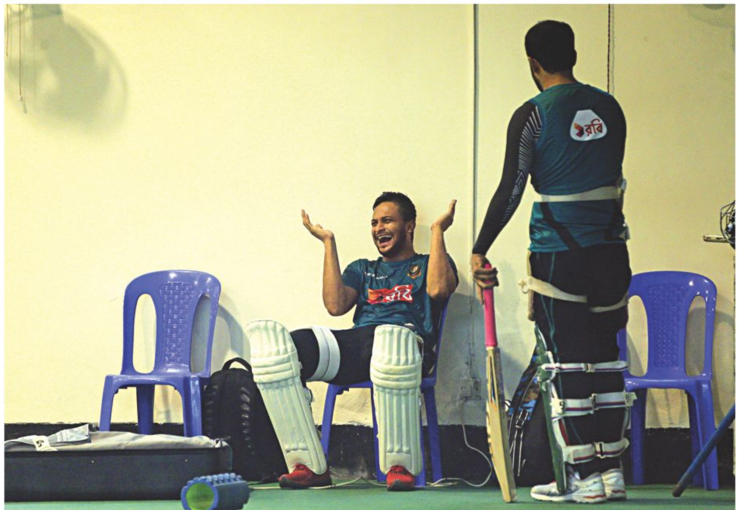
Premier Bangladesh all-rounder Shakib Al Hasan is having fun with his teammate at the indoor practice facility of the Sher-e-Bangla National Stadium in Mirpur yesterday.

"The atmosphere is different to all other tournaments so I enjoy it a lot. The places are very beautiful and nobody takes it too seriously. Of course it's serious on the field but off it everyone likes to be relaxed," he concluded.