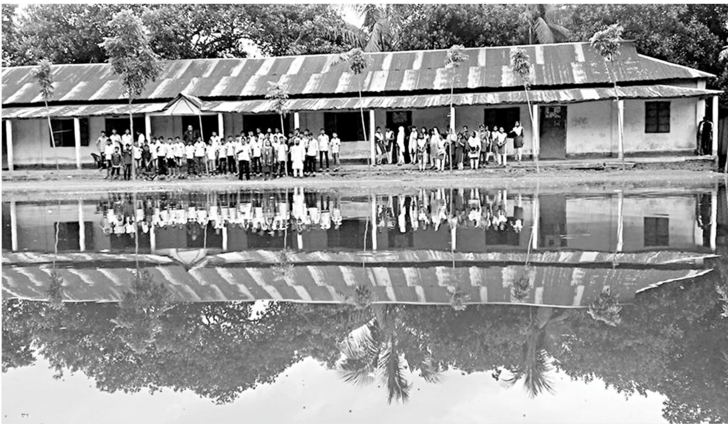
The ground of Kharua Barail High School in Mymensingh's Gafargaon upazila remains under water half of the year. The photo was taken recently.