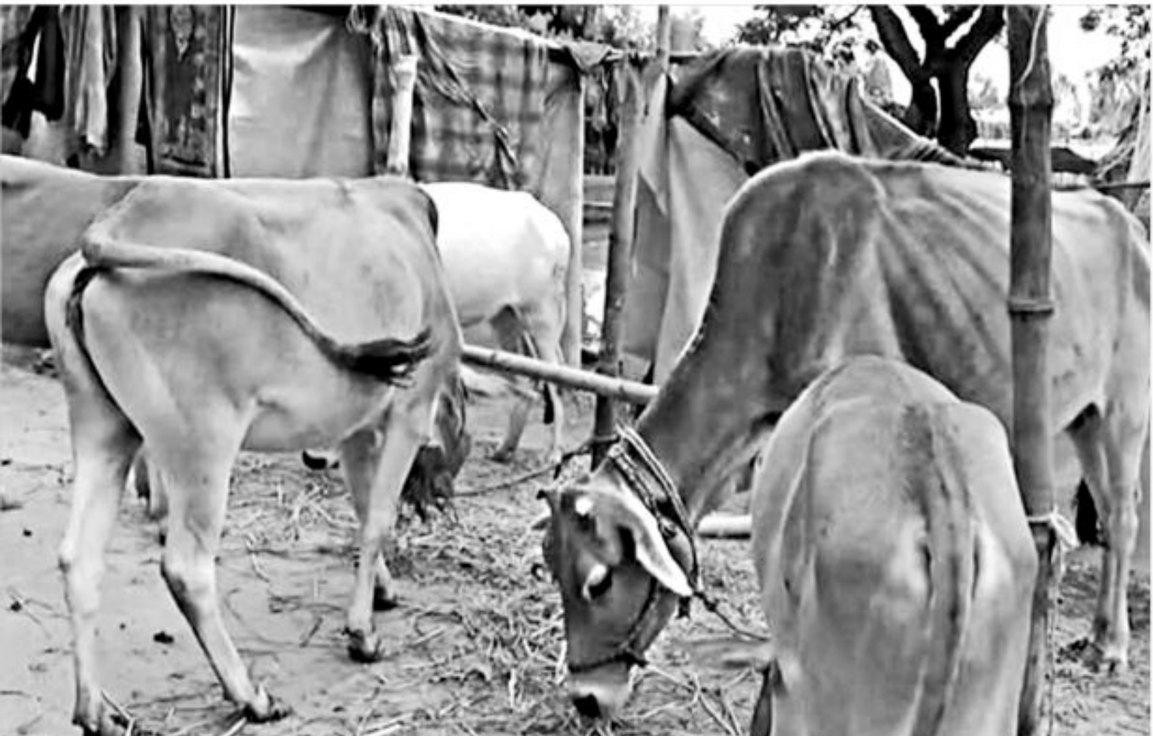
Cattle facing acute fodder crisis have been taken for shelter on a flood control dyke at Katkir Haat in Fulchhari upazila of Gaibandha.