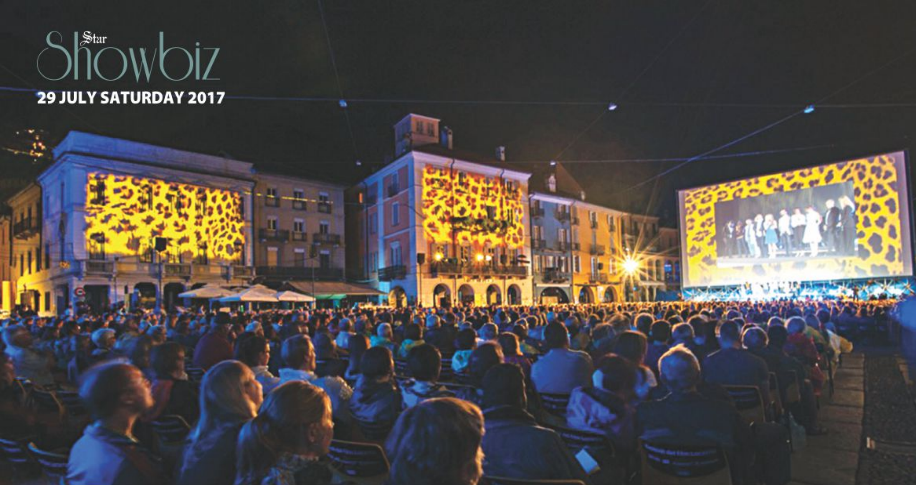
One of the largest open-air screenings in the world