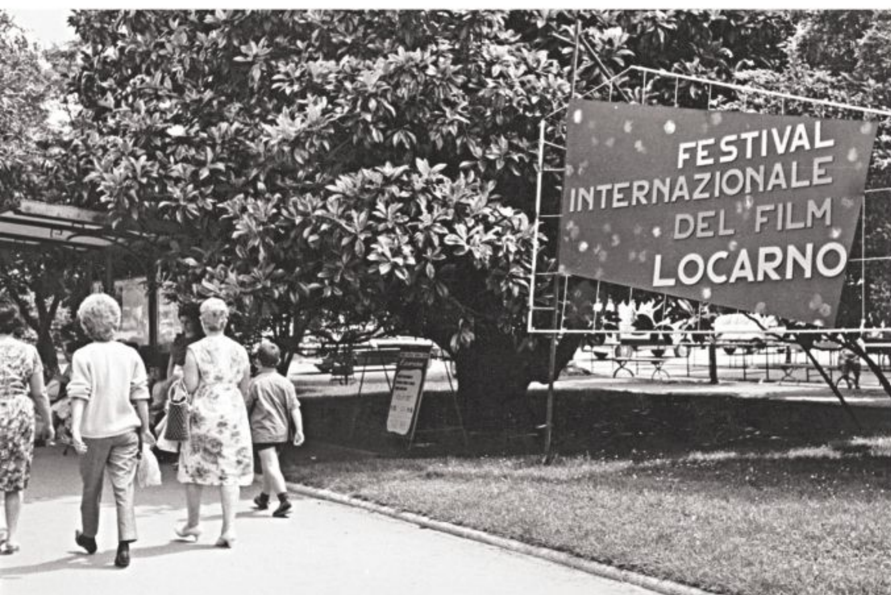
Locarno Festival in the past