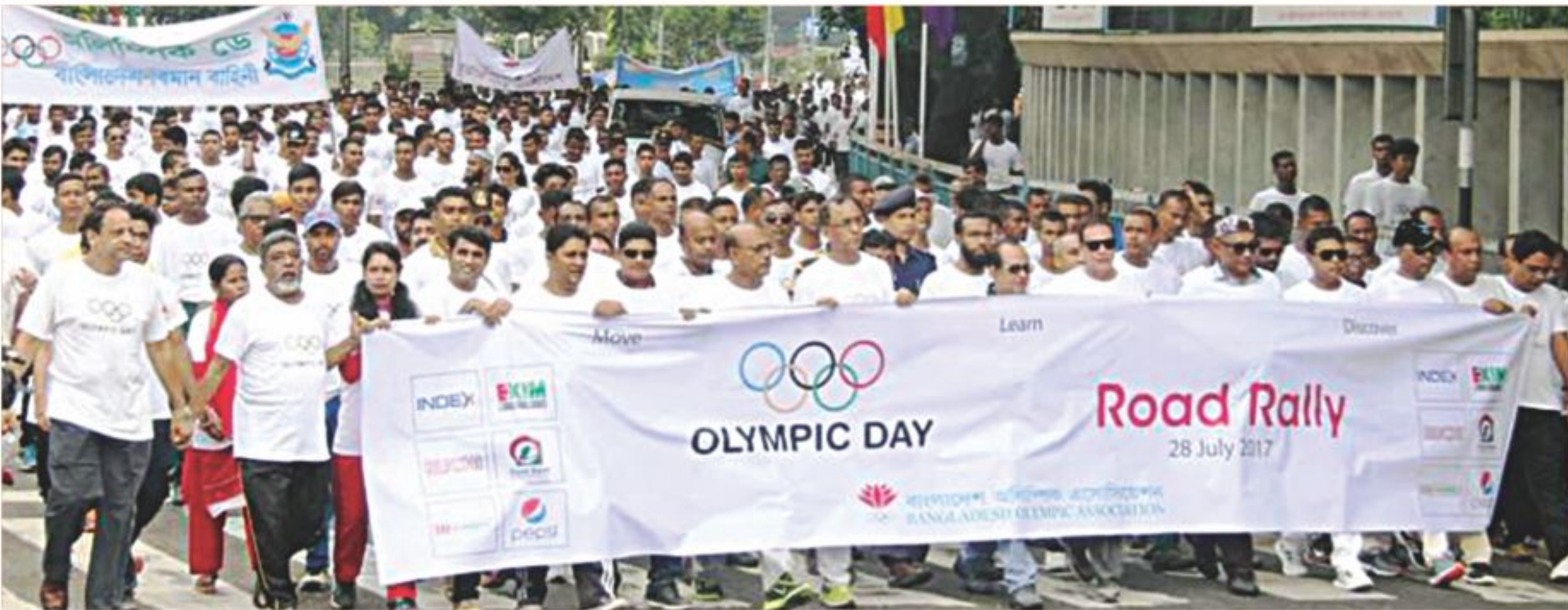
Men and women from all over gathered near the Ramna National Tennis Complex yesterday morning to participate in the Olympic Day Run, a global initiative of the IOC. The BOA also marked the occasion with other events throughout the day.

A legends game at the 'Casa Clasico' event at Bayfront Park in downtown Miami on Friday sees legends such as Patrick Kluivert, Fernando Hierro and Carlos Puyol among others all dust down their boots once again and recreate the magic moments of yesterday. Live music and DJs will keep fans entertained and on Saturday watch parties on huge TV screens are planned for those unlucky enough to miss out