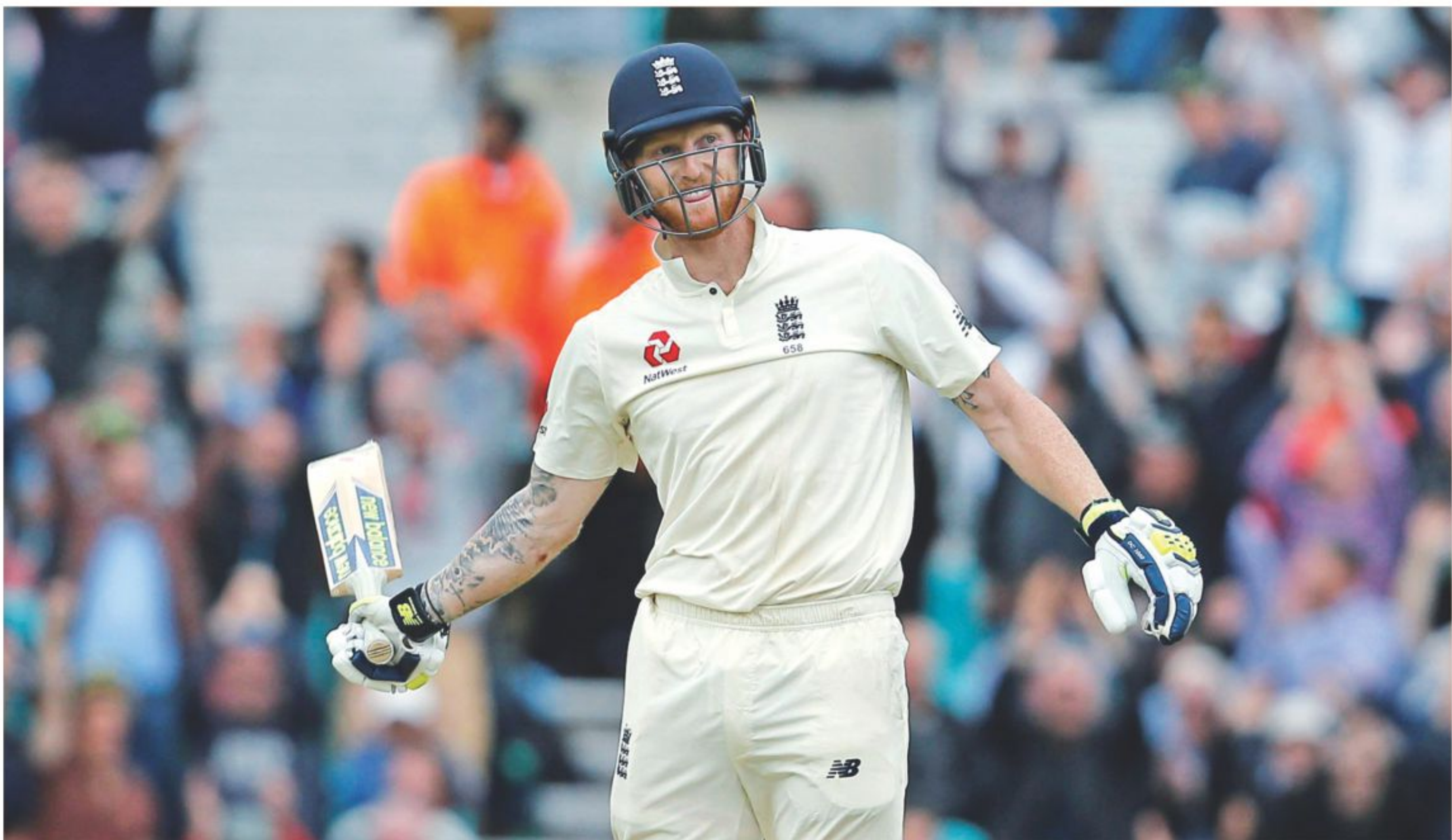
England all-rounder Ben Stokes celebrates his century on the second day of the third Test against South Africa at The Oval in London yesterday.