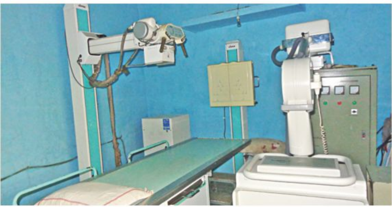
Attendants crowd the female ward of Sarishabari Upazila Health Complex in Jamalpur. Bottom left, Tk 19 lakh X-ray machine out of order since 2014 and bottom right, ECG and ultra-sonogram machines are lying idle on two hospital beds since 2014 and 2015 respectively for lack of cardiographer and sonologist.