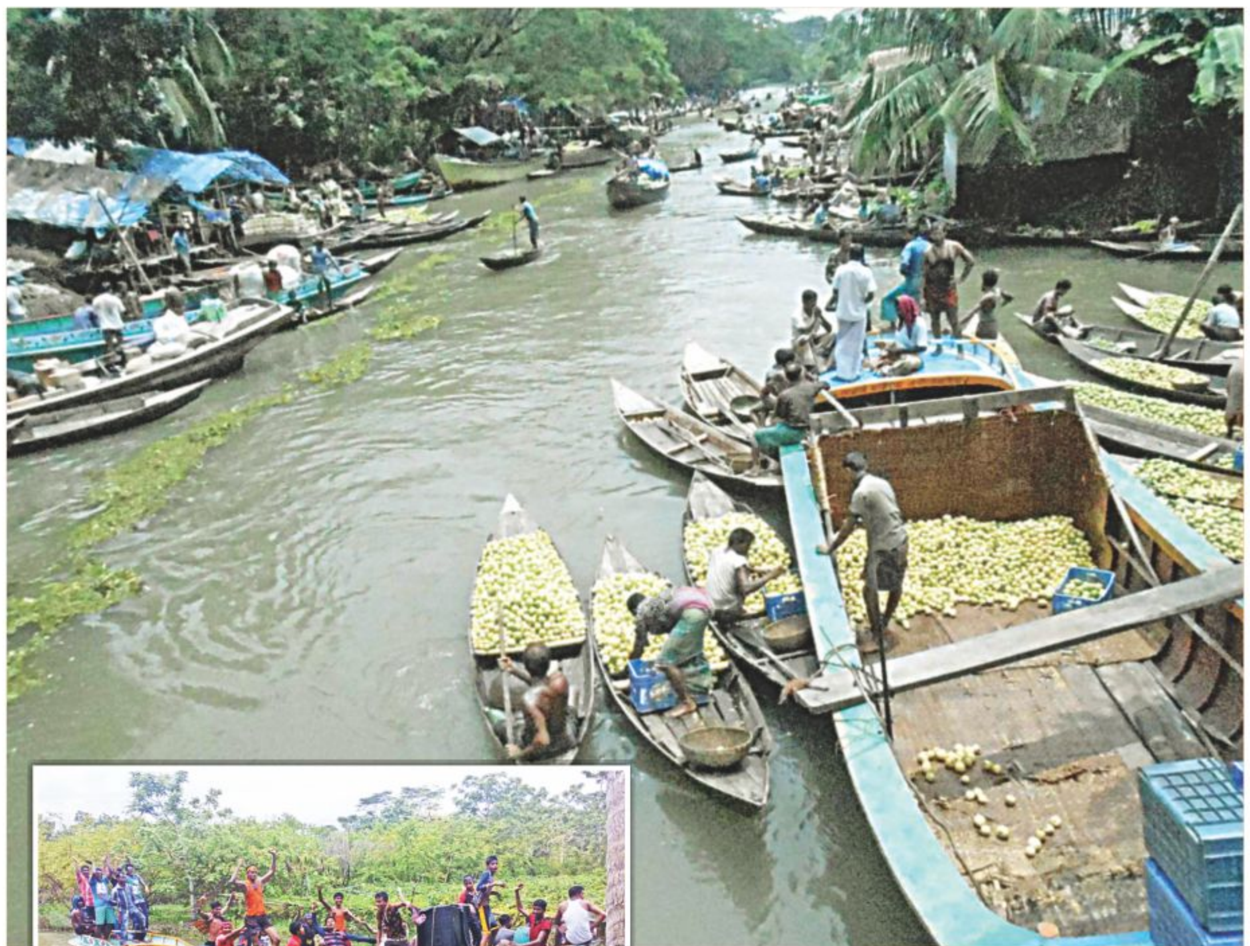
The traditional floating market, selling mostly guavas from boats on the canal at Vemruli in Jhalakathi Sadar upazila, is an attraction for wholesale buyers as well as curious visitors. Inset, a boatload of young tourists in a jovial mood at the site.

Detectives arrested Laily with 1,000 Yaba tablets worth Tk 3 lakh from Aiyermari village in Islampur upazila, the OC said.