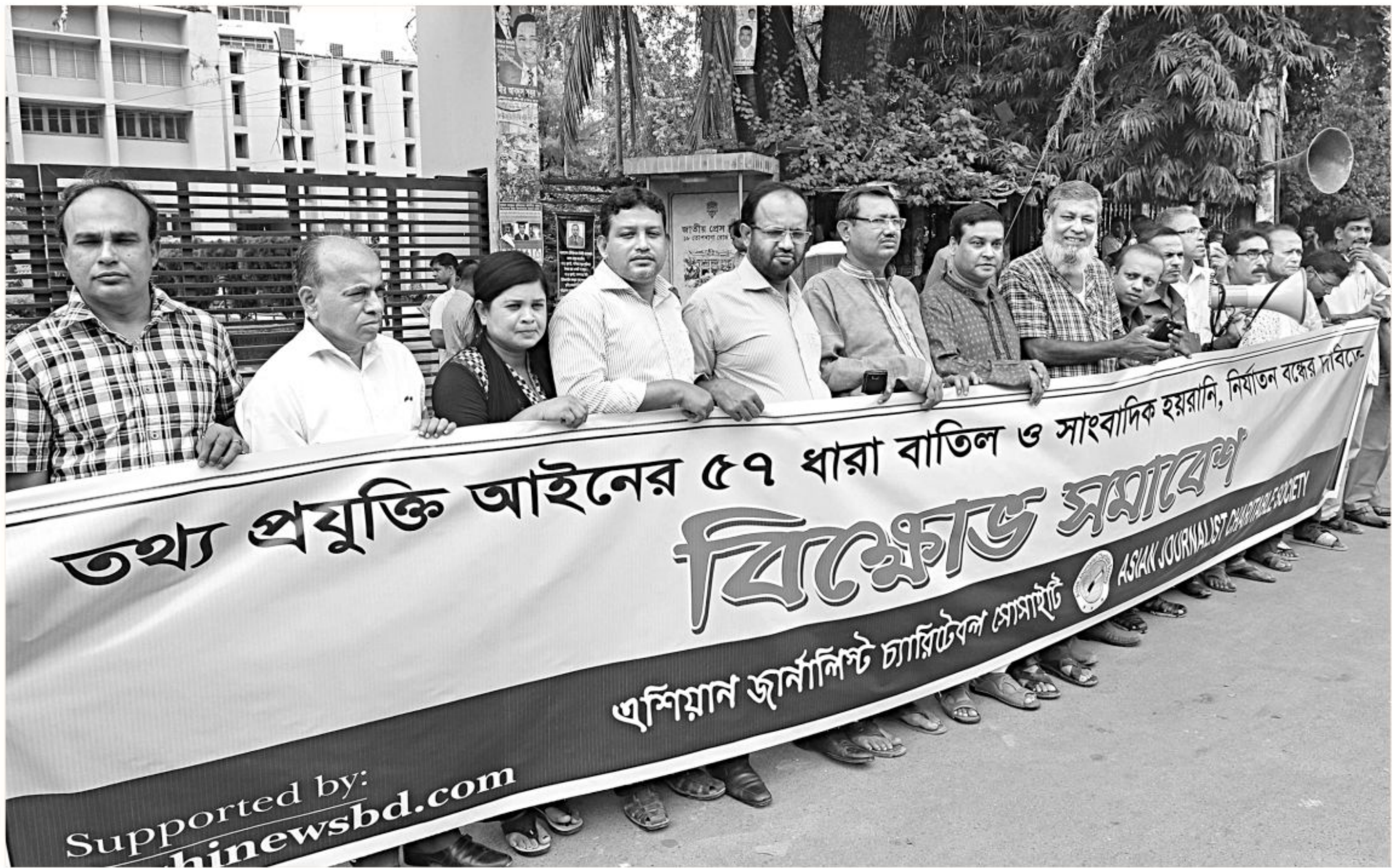
People under the banner of "Asian Journalist Charitable Society" form a human chain in front of the capital's Jatiya Press Club yesterday, demanding repeal of section 57 of the Information and Communication Technology Act and an end to harassment of journalists.