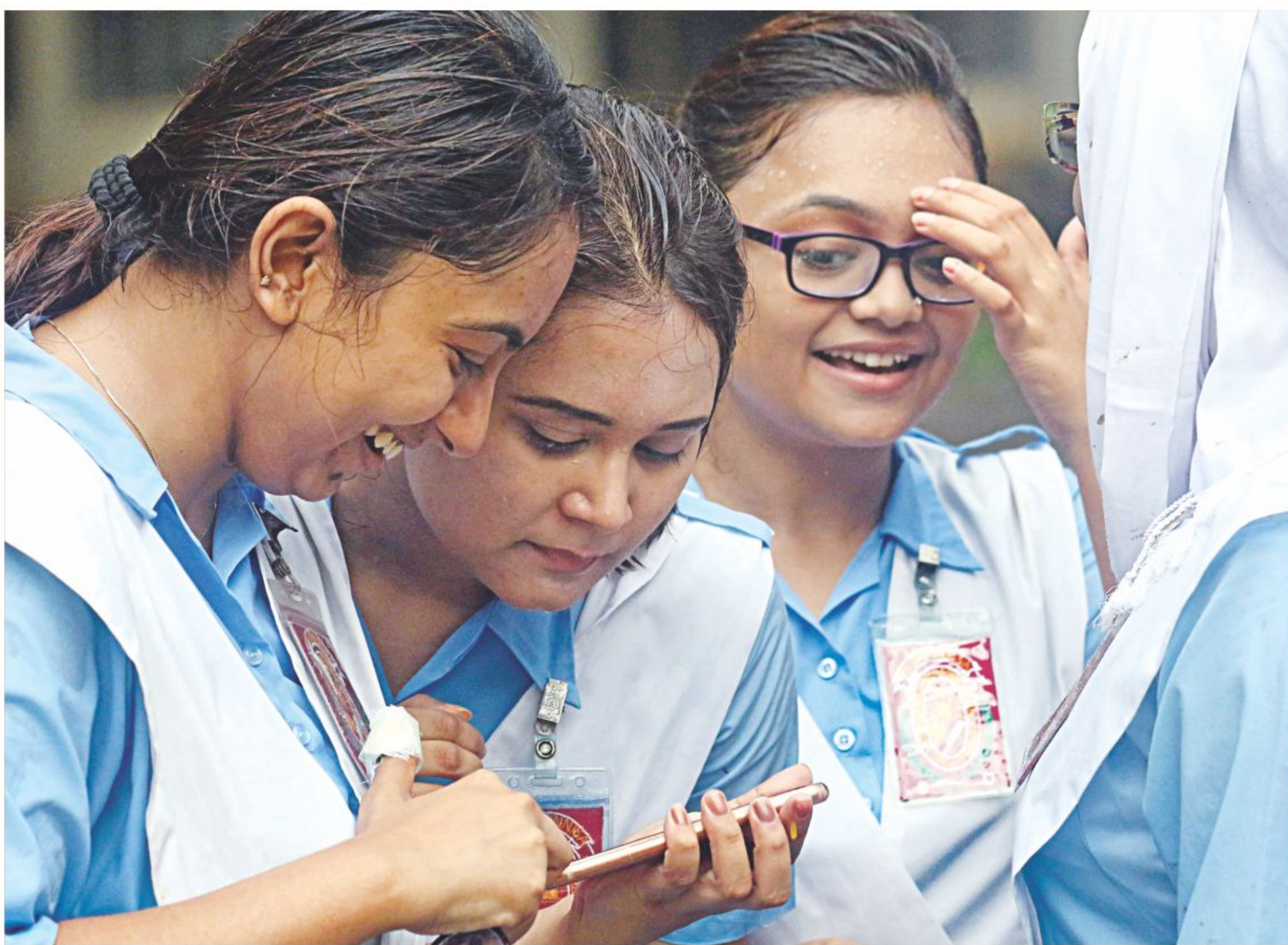
A smiling student shows another on a mobile phone how she did in her HSC exams at the Viqarunnisa School and College yesterday. It was not all smiles for everyone though, as this year's results marked a sharp drop in pass rate and the number of high achievers.