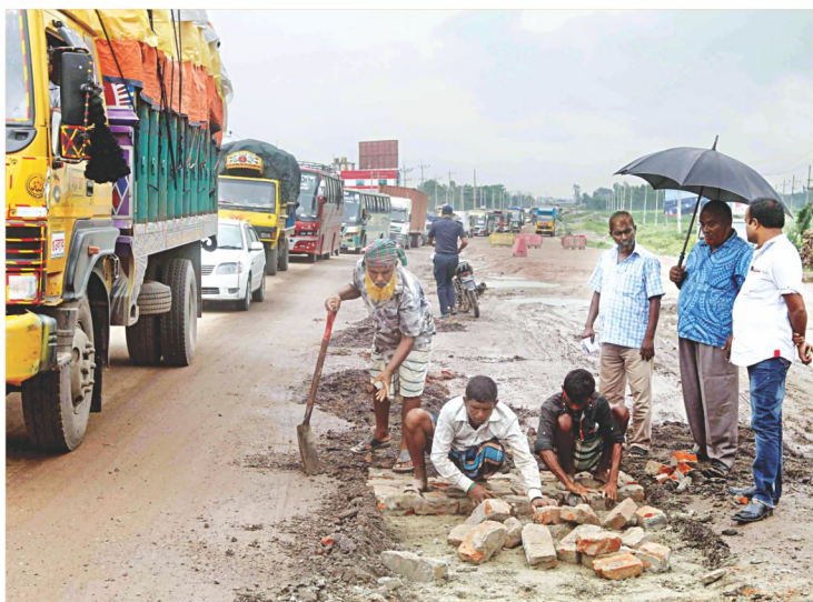
Due to the bad shape of the road and the ongoing road expansion work, vehicles take almost two hours just to travel the two kilometres from Rasulpur to Pungli on Dhaka-Tangail highway. The tailbacks stretch for miles.