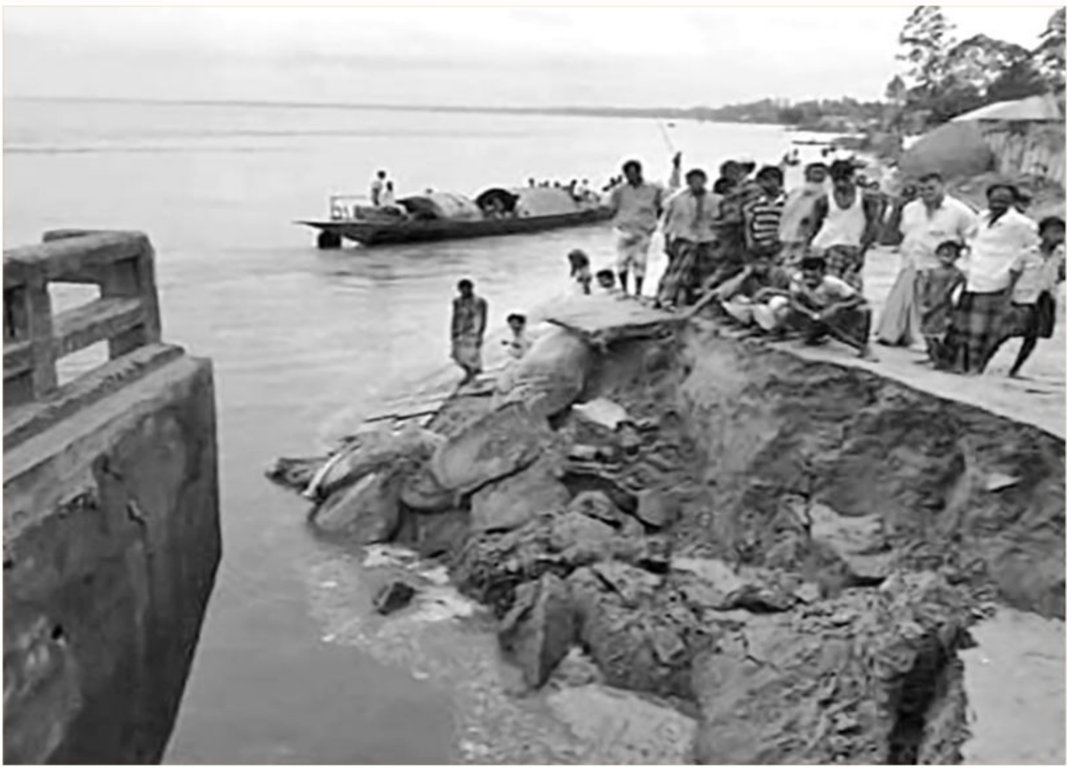
The under-construction embankment in Khaskaunia of Chowhali upazila in Sirajganj is devoured by the Jamuna river as the floodwater recedes. Right, people of the village on the bank, as families pack up their belonging, load them on a boat, and move to safer places.