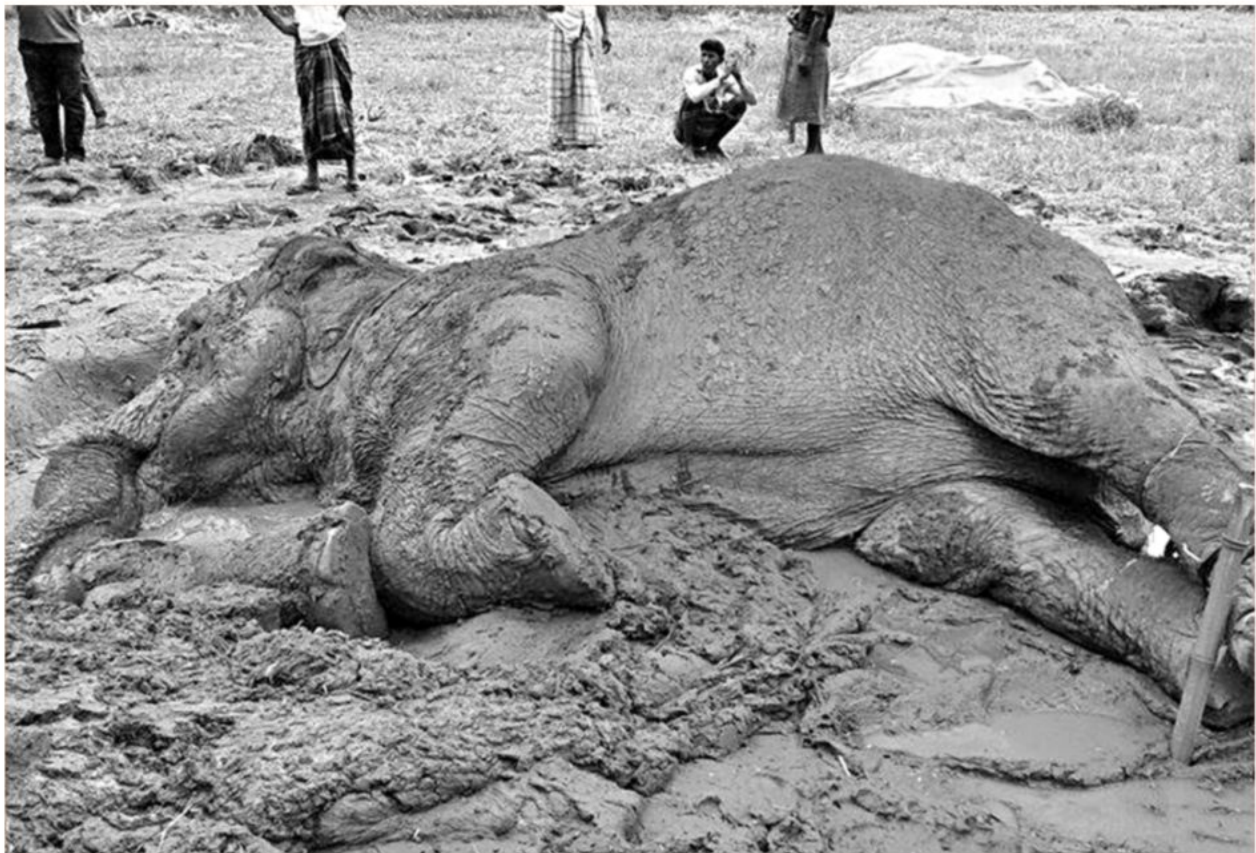
Injured elephant Rajlakkhi, undergoing treatment while lying on the ground at Ishobpur in Srimangal upazila of Moulvibazar, sees only a little improvement during the last few days as the local livestock department office lacks necessary equipment for treatment of injured animals.