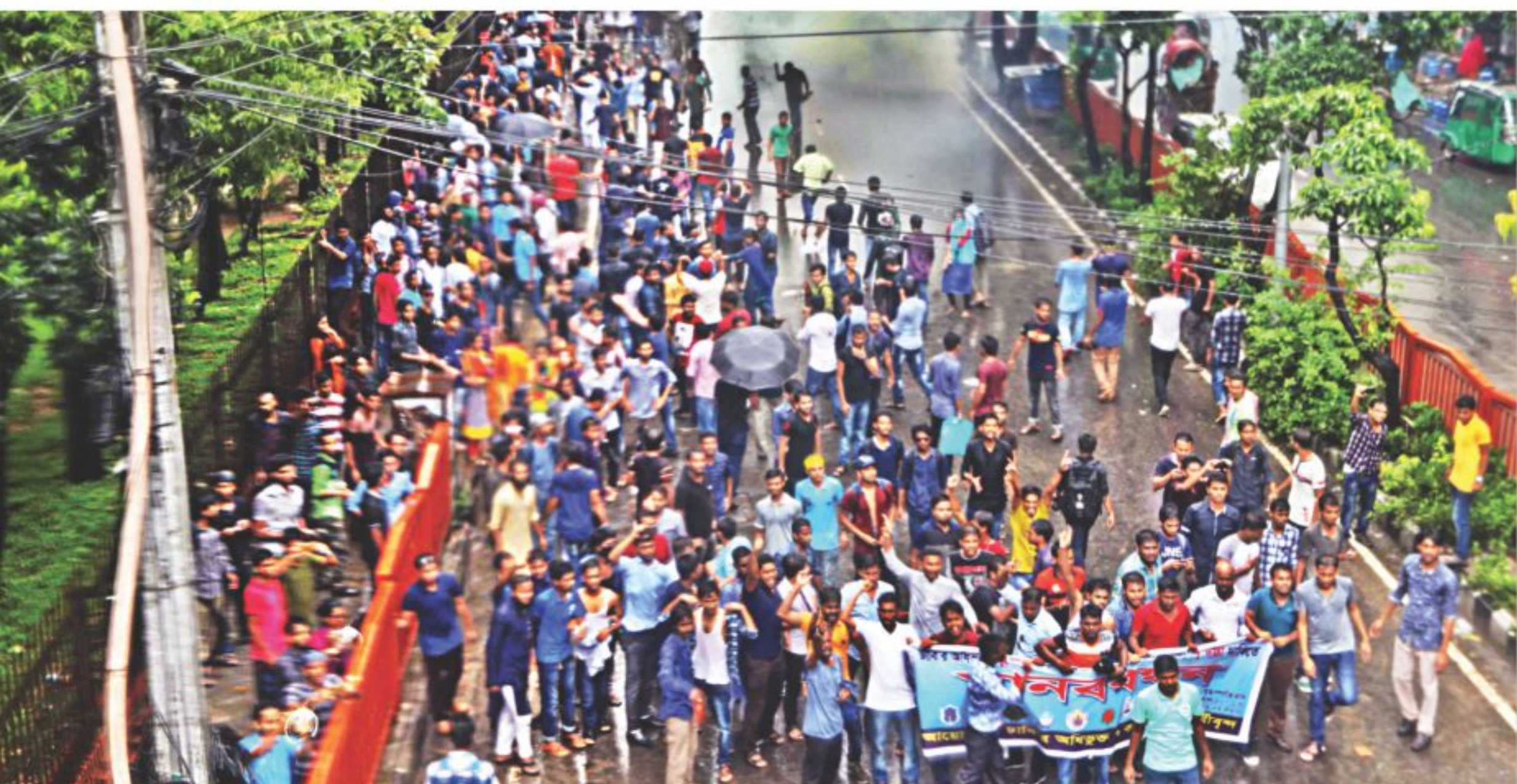
A section of students demonstrates on a street in the capital's Shahbagh yesterday. Students of seven colleges, recently affiliated with Dhaka University, brought out a procession in the area demanding their examination schedules. At one point, they had an altercation with police who charged batons and lobbed tear gas canisters to disperse them.

None of the BCL activists were available for comments.