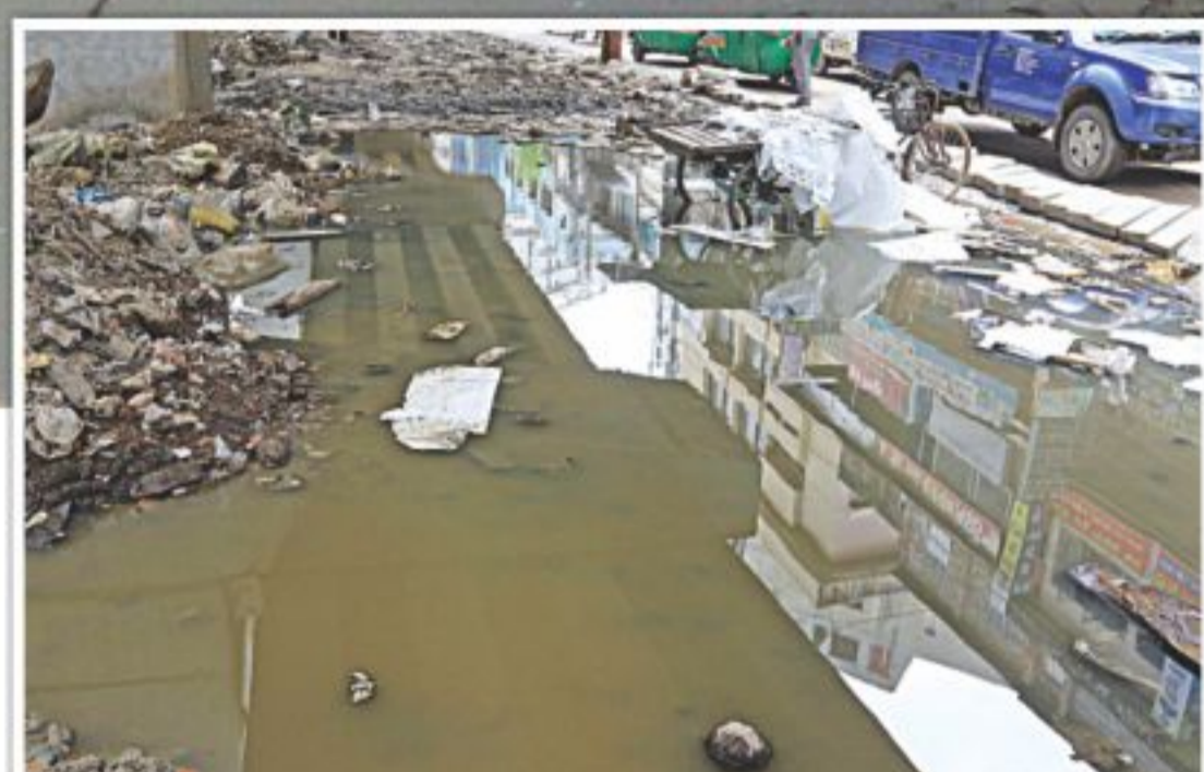
A close shot of mosquito larvae floating in stagnant water around a discarded coconut shell. The photo of the larvae surrounding the shell, inset, was captured on Tuesday underneath the Mouchak-Malibagh Flyover in the capital. Numerous locations in and around the flyover site are now breeding grounds of mosquitoes -- responsible for the ongoing chikungunya outbreak.