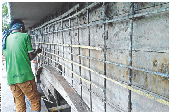
Bamboos are being used besides steel rods to extend the two-storey academic building of Bandarban Government Women College. It will result in a weak and risky structure, experts say. The photo was taken yesterday.