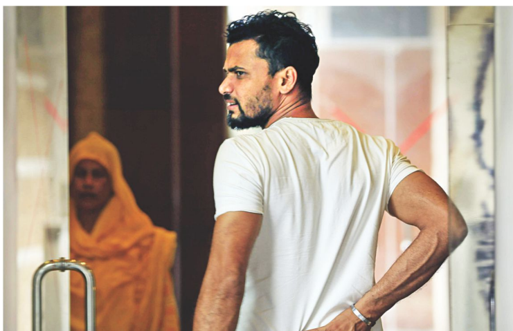
Bangladesh's inspirational ODI captain Mashrafe Bin Mortaza is certainly not complaining about any back pain. He was actually running fever for the last couple of days and briefly appeared at BCB headquarters in Mirpur yesterday, where the Tigers are going through a fitness camp for the last one week.

The all-rounder from Feni had some good performances during the HP tour to Australia where he made a hundred and also bowled well. It was nice to hear from the all-rounder that while those performances gave him confidence, he is still looking to improve his batting.