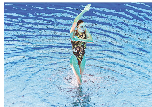
With an incredibly technical and rhythmized routine, Russia's Svetlana Kolesnichenko took gold in the women's solo free title yesterday at the 17th FINA World Championships.

Sri Lanka, batting first, scored 274-6 off 50 overs and appeared in a commanding position when Indian superstar Sachin Tendulkar was caught for 18.