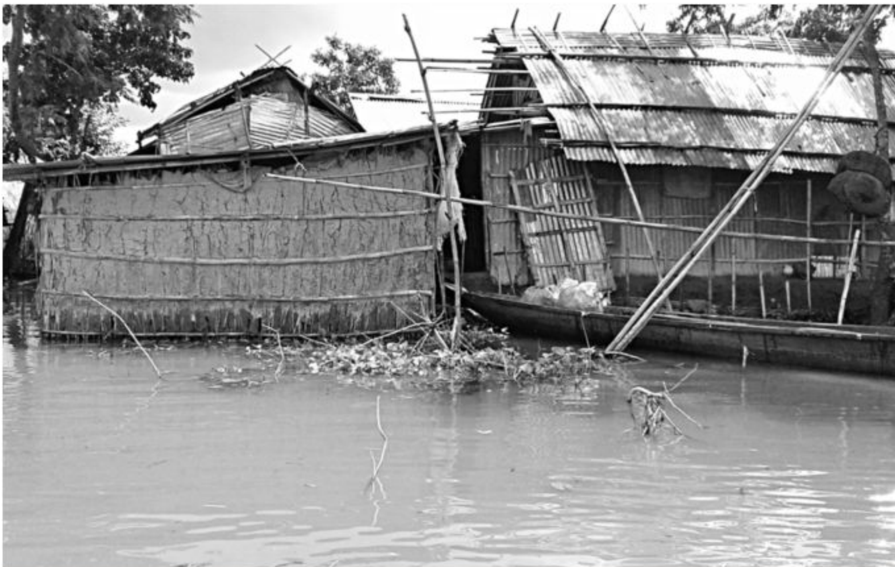
Houses damaged by floodwater at Bhularkandi village in Barlekha upazila of Moulvibazar, and right, a farmer shows damaged potol plants at his field of Char Shitaijhar village in Kurigram Sadar upazila.