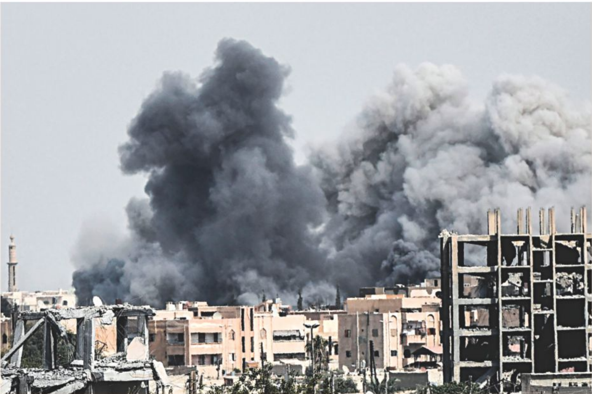
Heavy smoke billows following an airstrike on the western frontline of Raqqa yesterday during an offensive by the US-backed Syrian Democratic Forces, a majority Kurdish and Arab alliance, to retake the city from Islamic State (IS) group fighters.