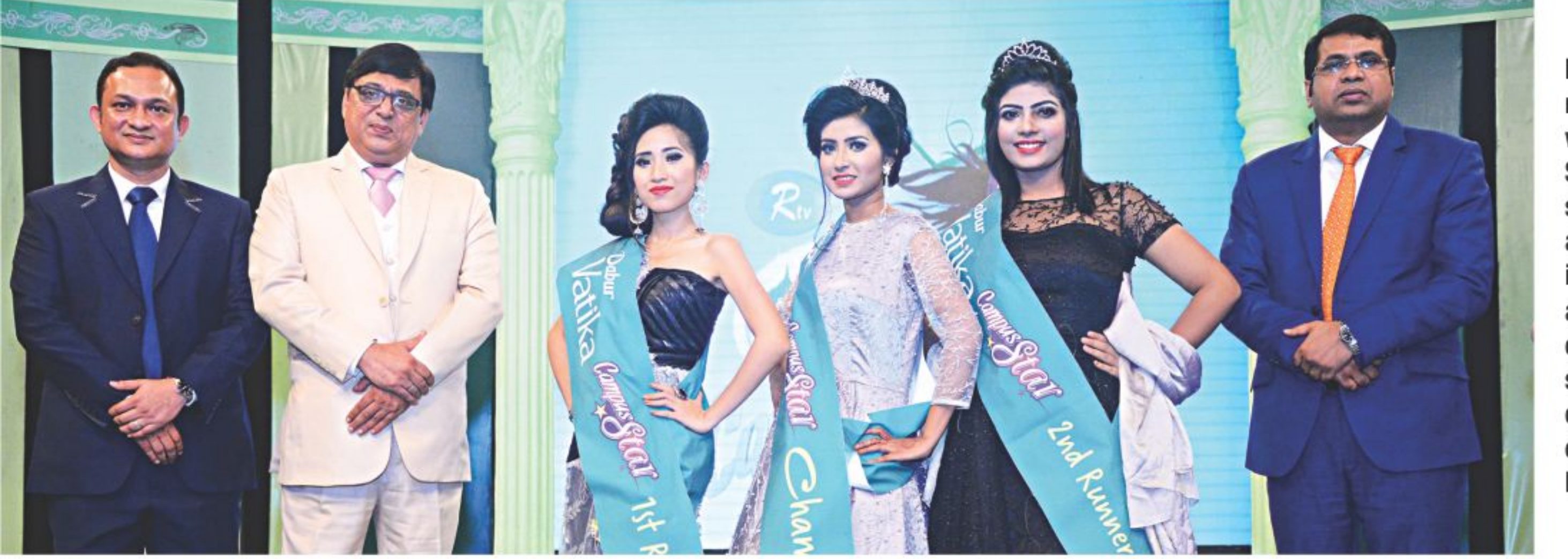
Rtv and Dabur Vatika recently crowned the winners of "Campus Star", a pageant for students of 15 private and public universities in singing, dancing and acting. High-ups of Dabur and Rtv are seen with the winners of the show, at the capital's Bengal Multimedia Studio.

Though Nidhi Agerwal has always wanted to be an actress, she never expected her dream to be fulfilled. Nidhi, who makes her Bollywood debut opposite Tiger Shroff in "Munna Michael", told Times of India: "That goal seemed impossible, considering that I come from a non-film background. I didn't know how to pursue my dream. However, the people around me would always say, 'You have a Bollywood face'." Eventually, she started modeling. It was only when she was offered a Kannada film did she realize that Bollywood could be possible as well. Her next stop was Mumbai where she started attending auditions. "I went through four rounds of auditions before I landed 'Munna Michael'," revealed Nidhi, adding: "I used to hate it when people would say, 'Oh, you are going to Mumbai to try and make a mark in the Hindi film industry'. Isn't everyone trying to make a mark in their chosen field?"