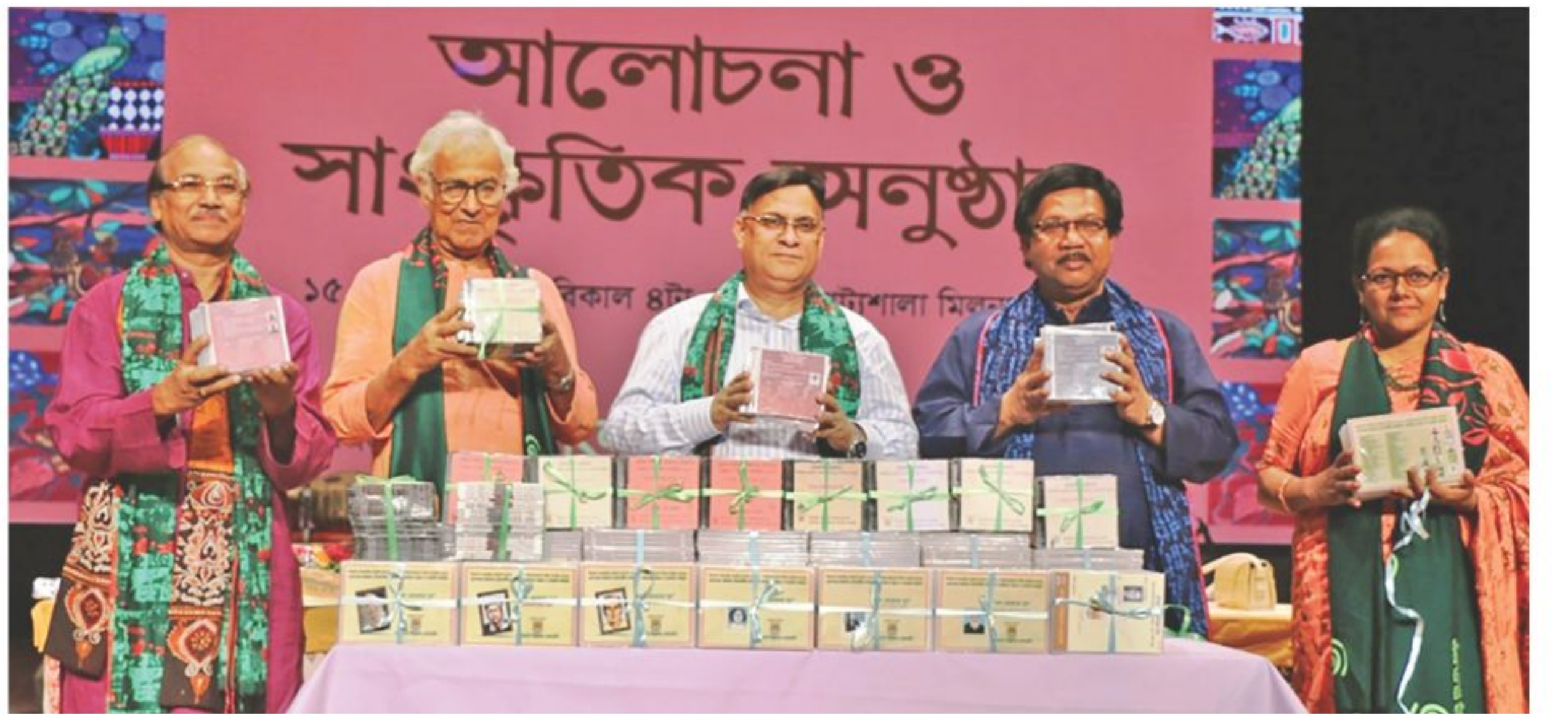
Guests at the DVD launch programme.