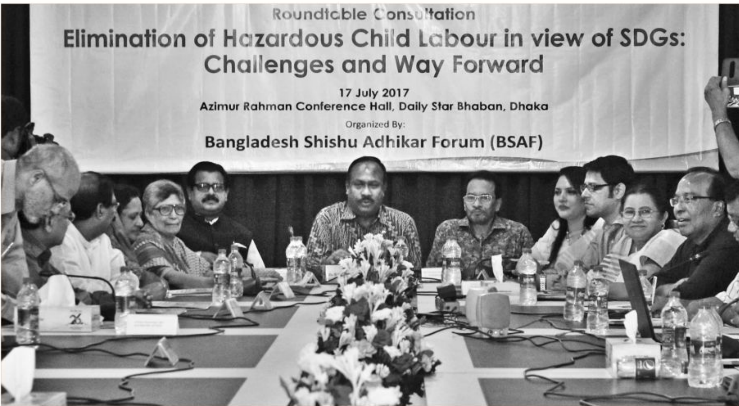
Participants at a discussion, "Elimination of Hazardous Child Labour in View of SDGs: Challenges and Way Forward" at The Daily Star Centre in the capital yesterday. Bangladesh Shishu Adhikar Forum organised the event. (See story on page 5)