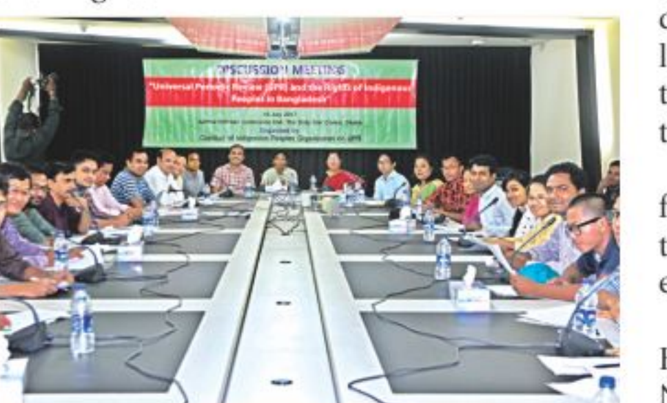
Speakers at the discussion.

Speakers at a discussion yesterday urged the government to take strict measures to stop violence against ethnic communities in order to uphold the country's image abroad. They also demanded that the government ensure rights of the communities. It will be an embarrassing situation for the country if the government fails to fix the issues before the United Nations publishes the third Universal Periodic Review (UPR) of human rights about Bangladesh in May 2018, they said. The observations were made at the discussion organised by the Coalition of Indigenous Peoples Organisation on UPR, at The Daily Star Centre in the capital. They recommended that the government establish Chittagong Hill Tracts Peace Accord completely, form an independent land commission for the plain land ethnic groups, and prepare a separate act to protect their rights.