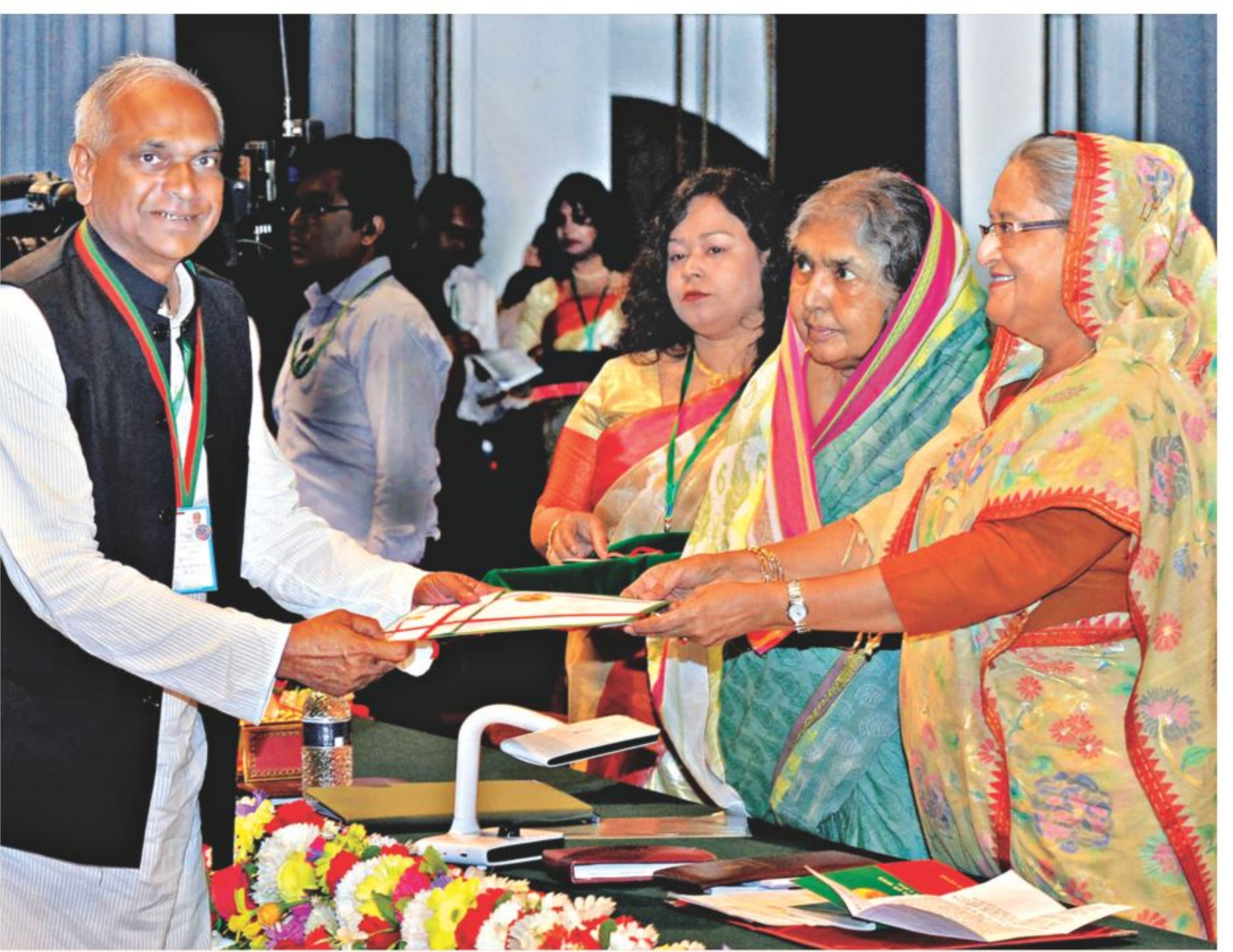
Prime Minister Sheikh Hasina hands over the Bangabandhu National Agriculture Award to one of the recipients in the capital's Osmani Memorial Auditorium yesterday.