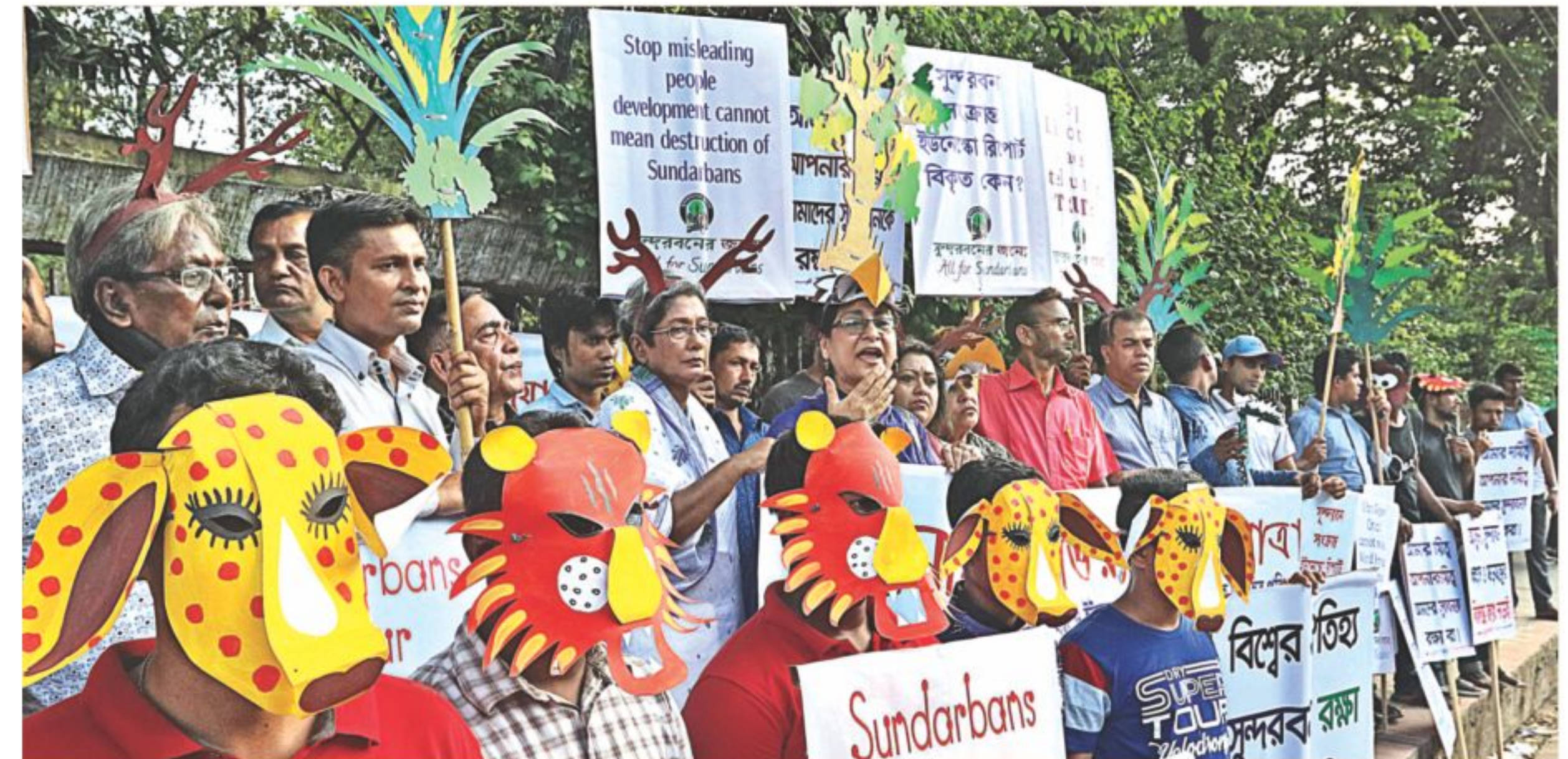
Wearing masks symbolising the Sundarbans' animals, people under the banner, "All for the Sundarbans" hold a rally in front of the capital's Jatiya Press Club yesterday. The rally demanded that the construction work of the Rampal power plant project be stopped.

The government may not issue a gazette notification on the rules of discipline and code of conduct for lower court judges within this week even though the Supreme Court had given a two-week ultimatum for issuing the notification 15 days ago. Yesterday, Law Minister Anisul Huq said the government would finalise the rules and code of conduct and publish the gazette notification by the next week. The rules will be finalised after a meeting with Chief Justice Surendra Kumar Sinha on Thursday, the minister told The Daily Star after a meeting with the chief justice at his SC office in Dhaka yesterday. "After finalising the rules, these will be sent to the president. Following president's endorsement, the gazette notification will be issued," he said. On July 2, the seven-member bench of the Appellate Division gave the government a two-week ultimatum for issuing the gazette. "It's the last chance," head of the bench, Chief Justice Surendra Kumar Sinha, had said. On that day, the law minister hoped that the gazette notification would be issued before July 15. With July 2's ultimatum, the apex court has so far extended the deadline 20 times for issuing the gazette notification, SC sources said. Yesterday, the apex court was scheduled to hear this issue, but it adjourned the hearing till today, as Attorney General Mahbubey Alam was absent.