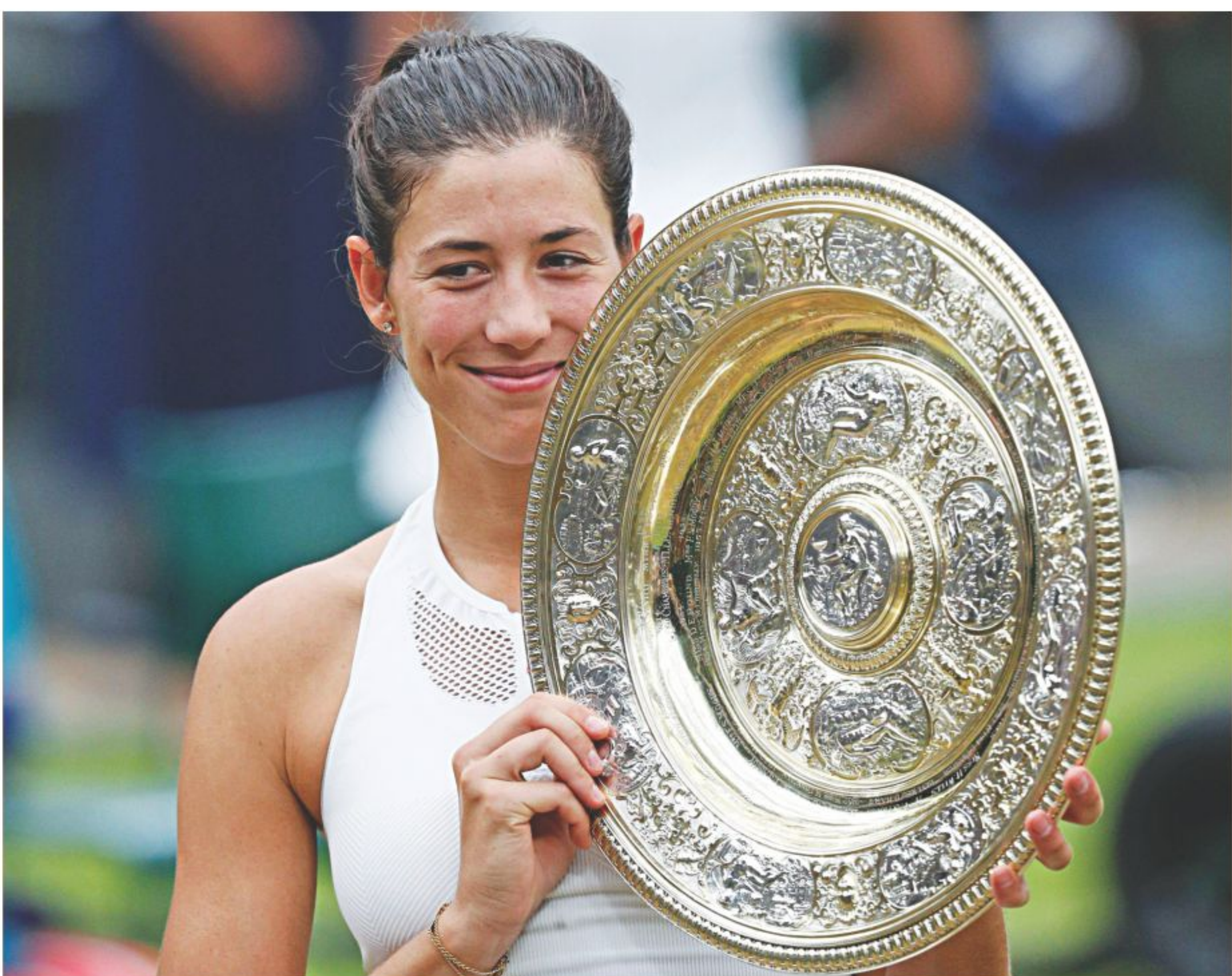
Spain's Garbine Muguruza celebrates with the Venus Rosewater Dish trophy after beating Venus Williams of USA in the women's singles final in Wimbledon yesterday.

The injury prompted United to shelve plans to exercise an option to give Zlatan a second season with the club, with the player officially released last month.