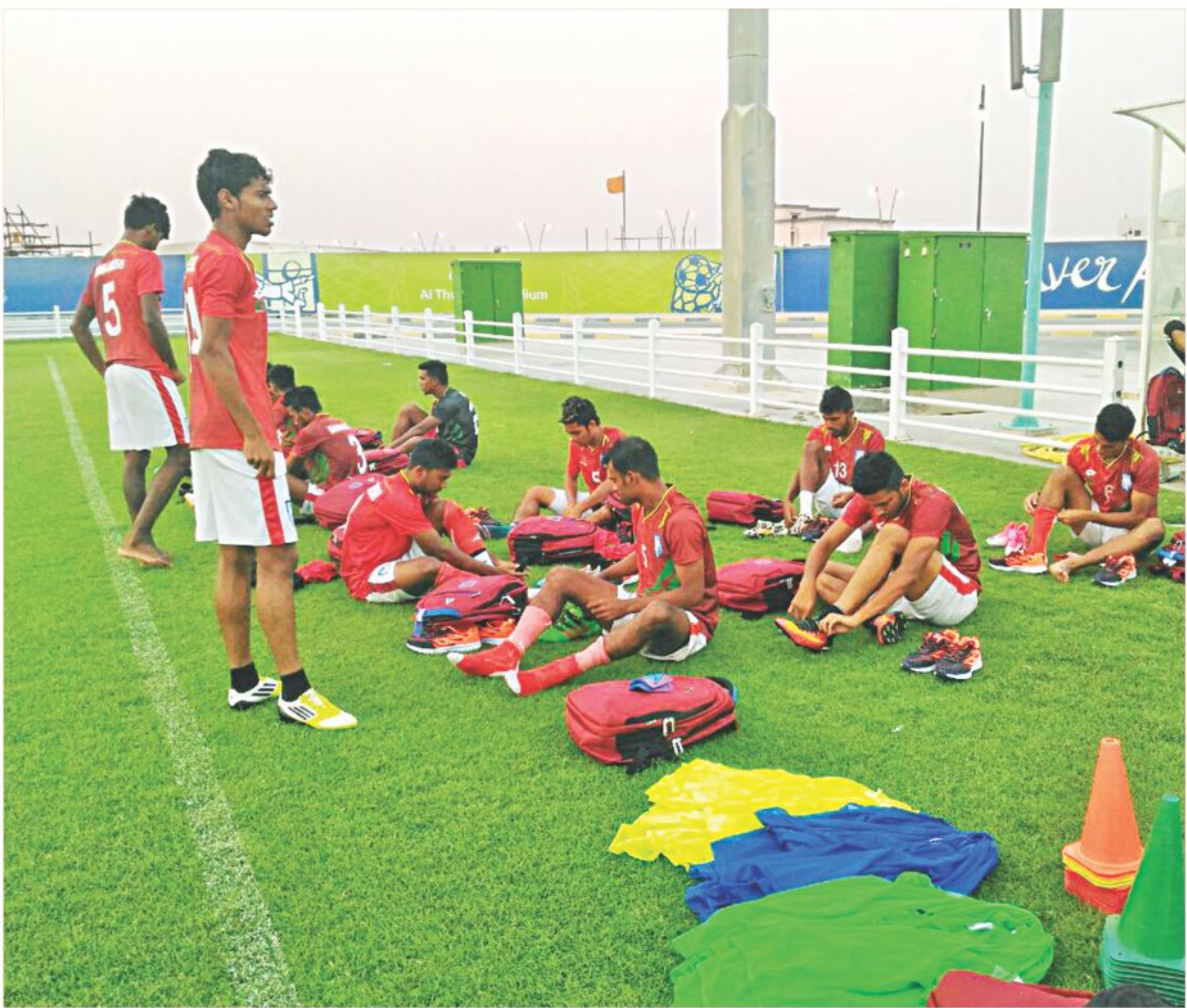
The Bangladesh U-23 team geared up at the Al Thumama Stadium in Qatar yesterday for the upcoming AFC U-23 Championship in Palestine. Having arrived in Qatar on Wednesday to play a practice match, the team have been given three days to train before leaving for the tournament tomorrow.

Bakayoko is Chelsea's third major signing of the close season so far, following the arrivals of goalkeeper Willy Caballero from Manchester City and German centre-back Antonio Rudiger from Roma.