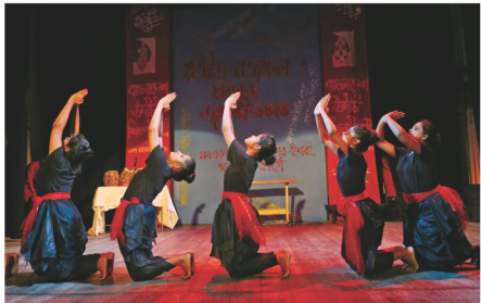
A group of dancers perform at the event.

The second segment of the programme featured poetry recitation, music and dance by artists of Udichi's various Dhaka units, and closed with a staging of Kazi Nazrul's play "Bhooter Bhoi" by the theatre unit of Udichi's Dhaka Metropolitan Sangsad.