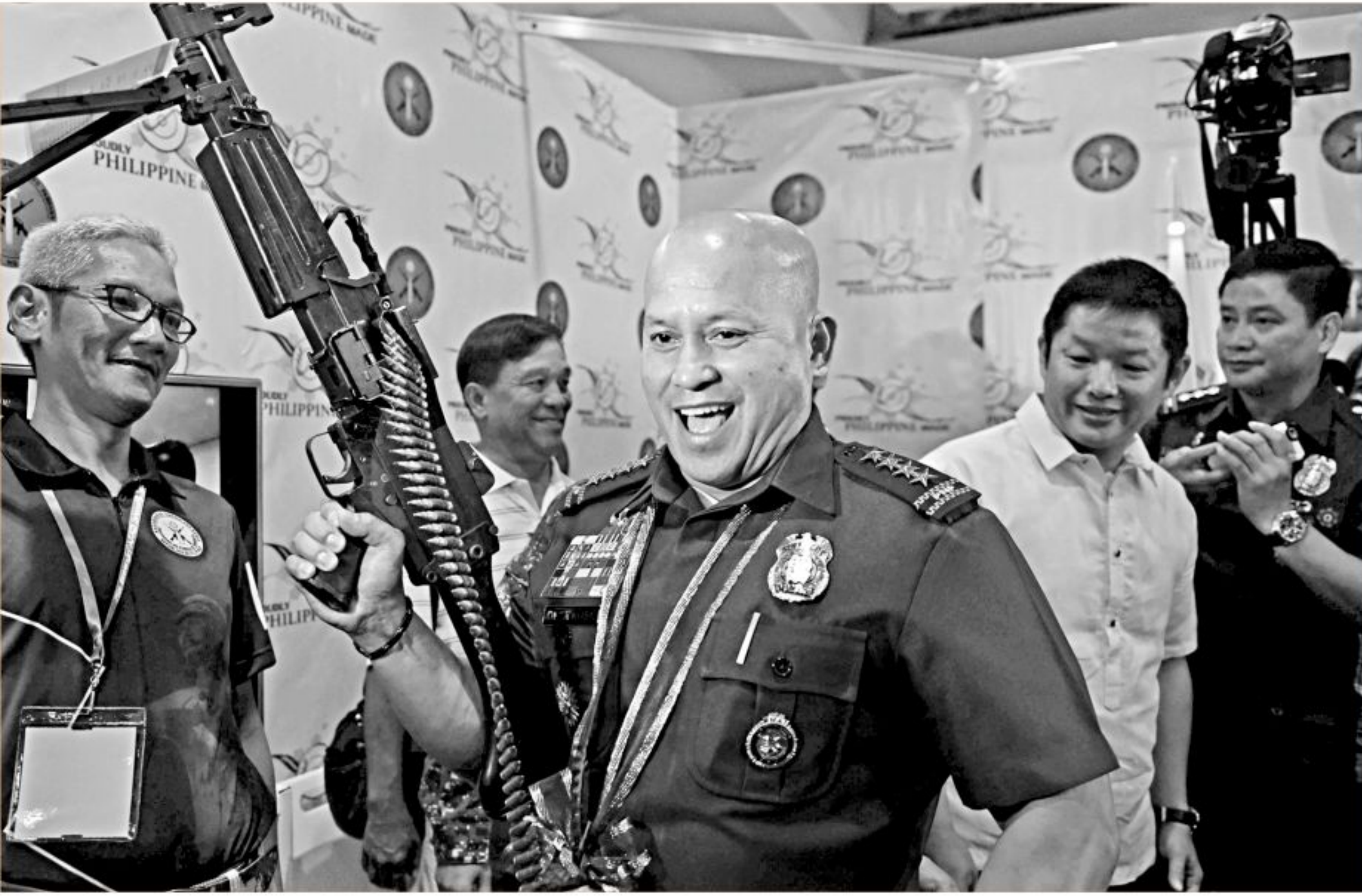
Philippine National Police chief Ronald Bato Dela Rosa holds an M60 machine gun during a Gun and Ammunition show at a mall in Mandaluyong city, metro Manila, Philippines, yesterday.

The NGT directed the Uttar Pradesh and Uttarakhand governments to formulate guidelines for religious activities on the ghats of the Ganga or its tributaries.