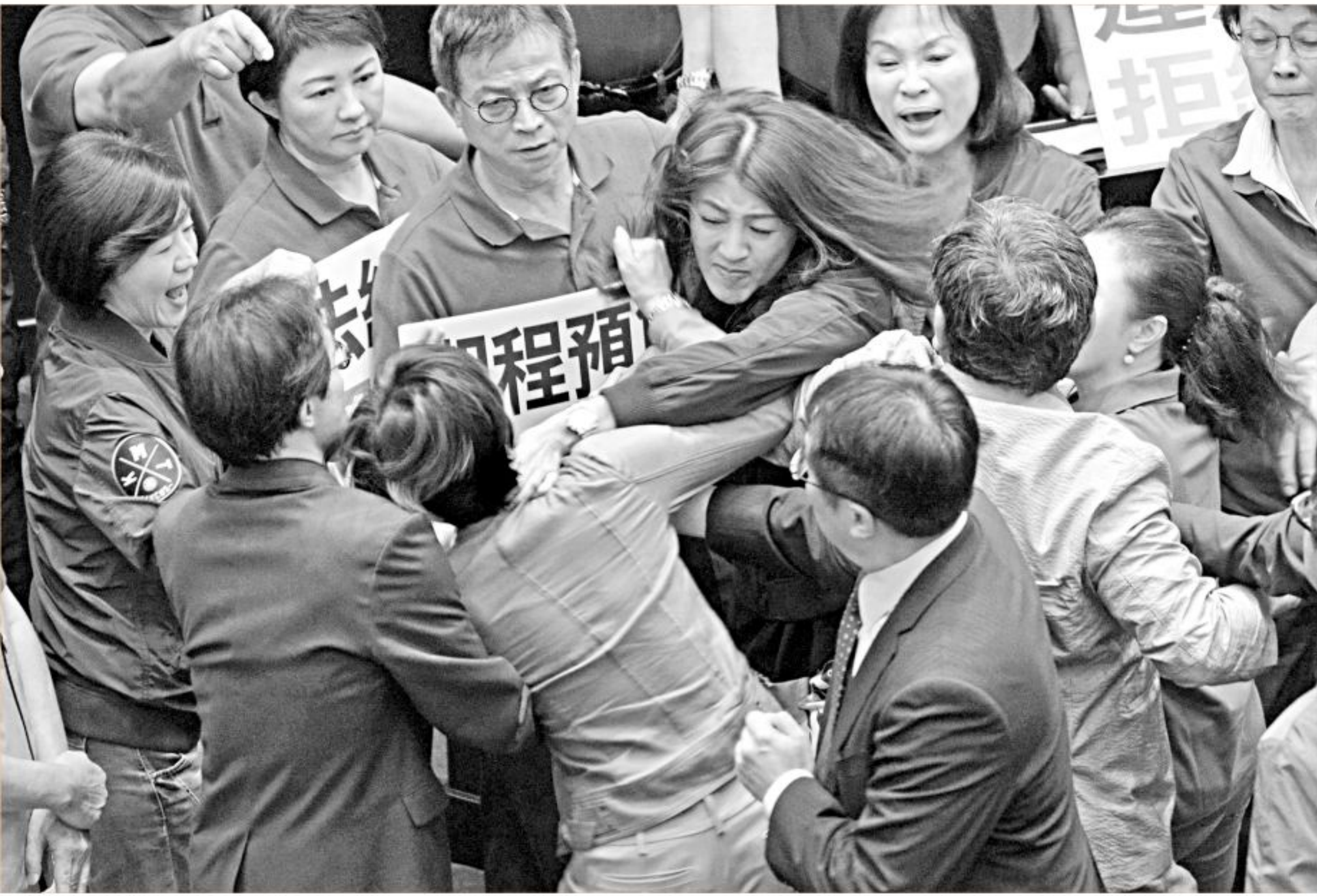
Taiwan's main opposition legislator Hsu Shu-hua brawls with a member of ruling Democratic Progressive Party during a review of a major infrastructure project at the Parliament in Taipei yesterday as the government of President Tsai Ing-wen pressed ahead with controversial reforms.