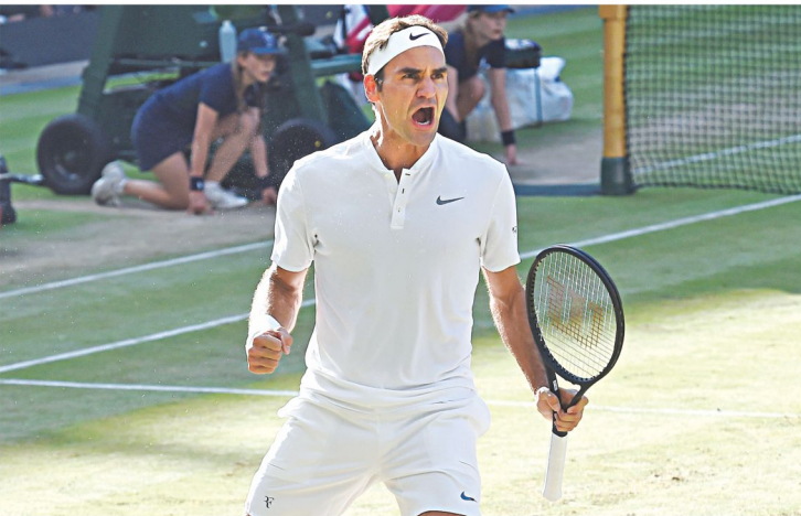
Switzerland's Roger Federer moved into the Wimbledon semifinals after defeating Milos Raonic 6-4, 6-2, 7-6 in the quarterfinals at the All England Club yesterday.