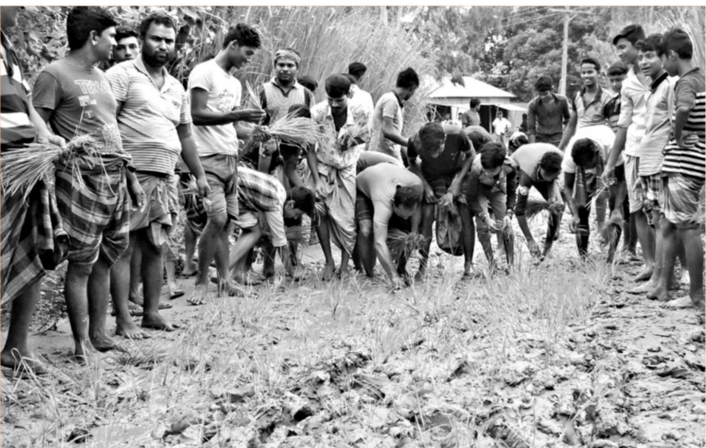
Villagers yesterday plant paddy saplings on Bartha-Duminibari road in Duminibari area of Basail upazila in Tangail protesting the bad condition of the road.