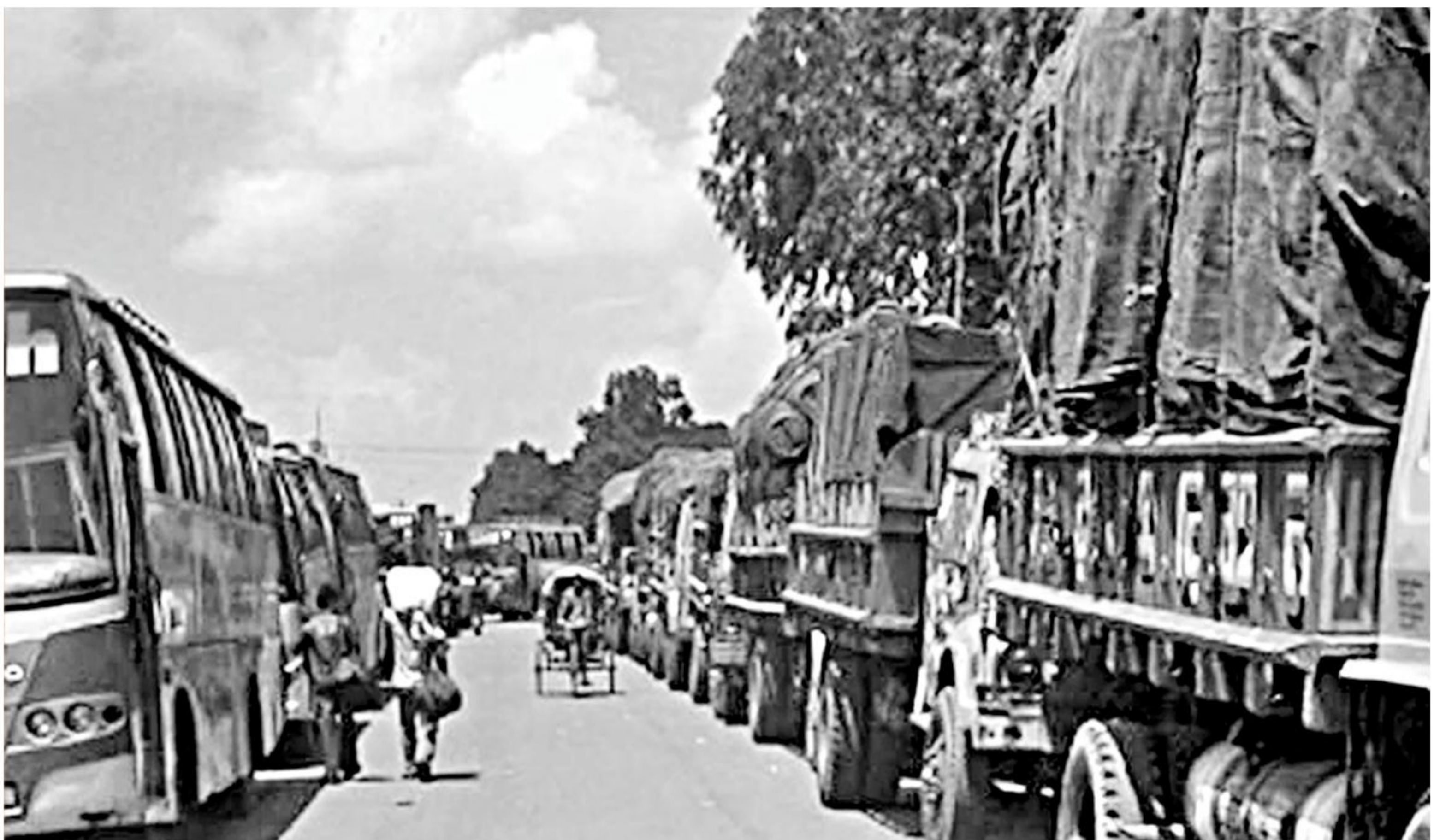
Passenger buses and goods-laden trucks wait in long queues to enter Paturia ferry terminal in Manikganj as strong current in the Padma causes unusual delay of ferries, shortening their number of trips across the mighty river.