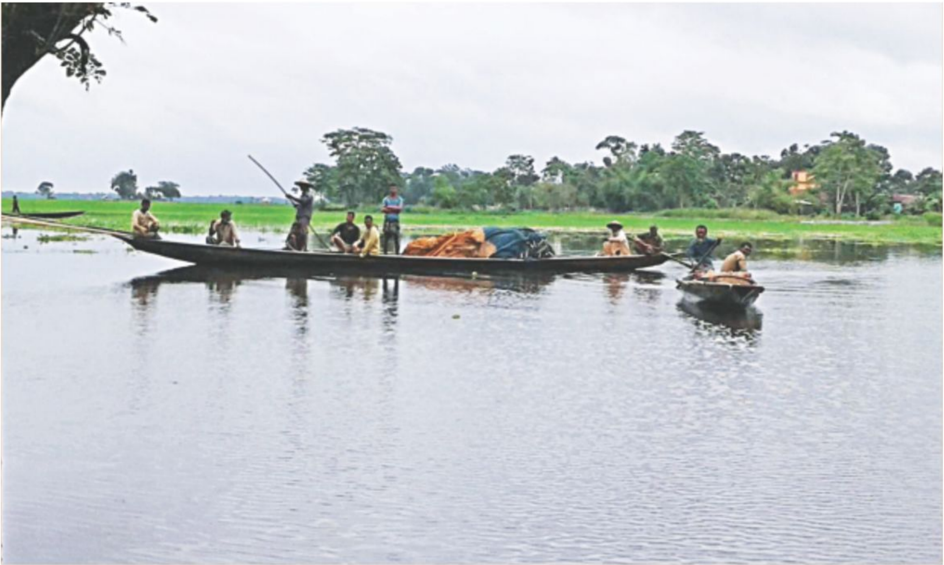
Fishermen now get only small quantities of fish in haor areas of Moulvibazar and Sylhet, a strikingly unusual situation during the ongoing monsoon. The photo was taken from Moulvibazar Sadar upazila yesterday.

ration for committing robbery, a Rab patrol team rushed to the spot. When the elite force challenged the duo, they opened fire on them. The Rab men retaliated. Three of the gang members fled in a private car. Rab members recovered two bullet-hit robbers from the spot and sent them to Feni Sadar Hospital where on-duty doctor declared Faisal dead. The body was sent to the hospital morgue for autopsy. They also recovered the firearms, bullets and knives from the spot. Injured Noor Hossain Selim is a son of Obaidul Haque. He hails from Char Sonapur village in Sonagazi upazila of the district. The commander said preparations are going on to file a case by the elite force in connection with the incident.