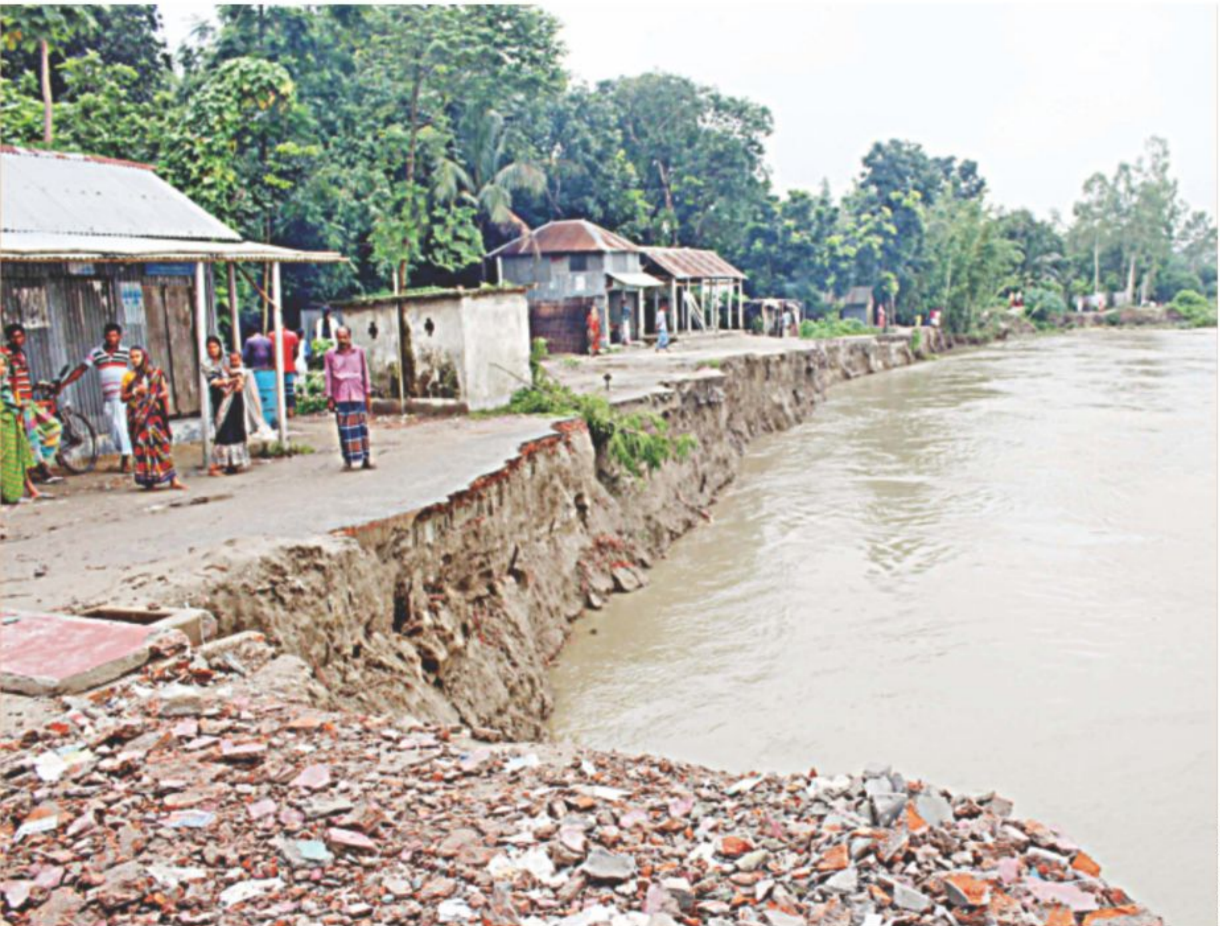
The Dhaleswari river is about to devour Aagdighulia bazar in Nagarpur upazila of Tangail. The photo was taken yesterday.