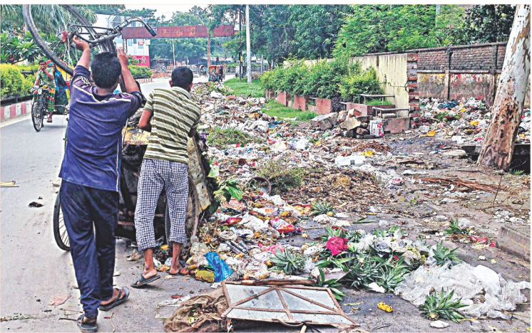
Workers of Rajshahi City Corporation dump waste on a side of a street yesterday. Though there is a designated dumping zone behind the boundary walls, they continue to do so for the last three days. The workers are on a strike to press home their 11-point demand, including implementation of wage structure fixed by the government. The photo was taken near Bilshila intersection of the city.