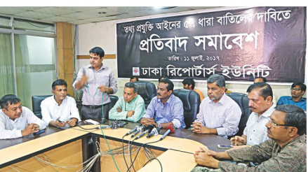
Journalists at a rally at DRU yesterday demanding the scrapping of section 57.