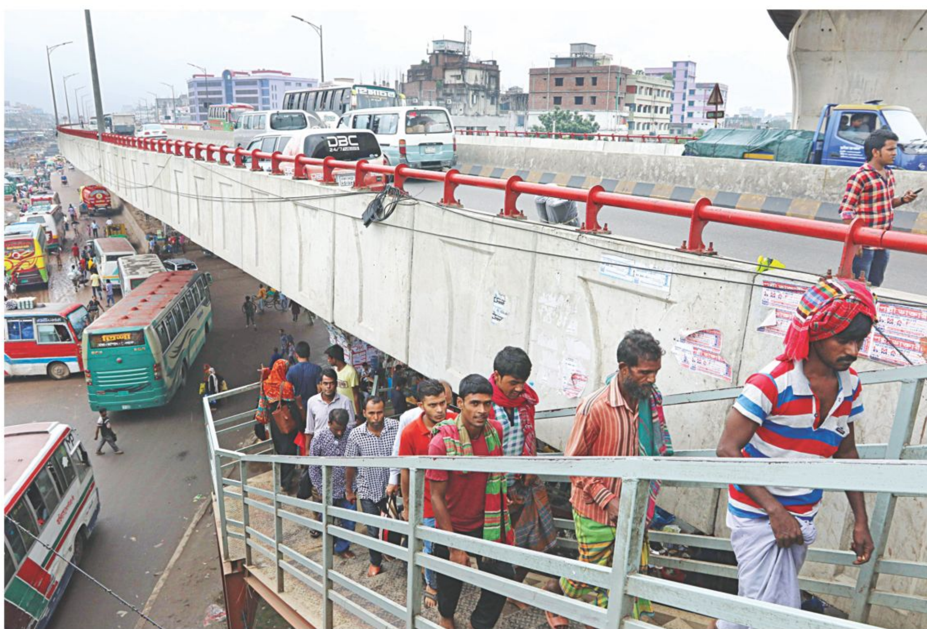
People use a service staircase yesterday to get onto the Hanif flyover to get on buses illegally, but these must go now. The Supreme Court has upheld a High Court order for removal of the stairs at different points of the flyover. The photo was taken near the Jatrabari Intersection area in the capital.