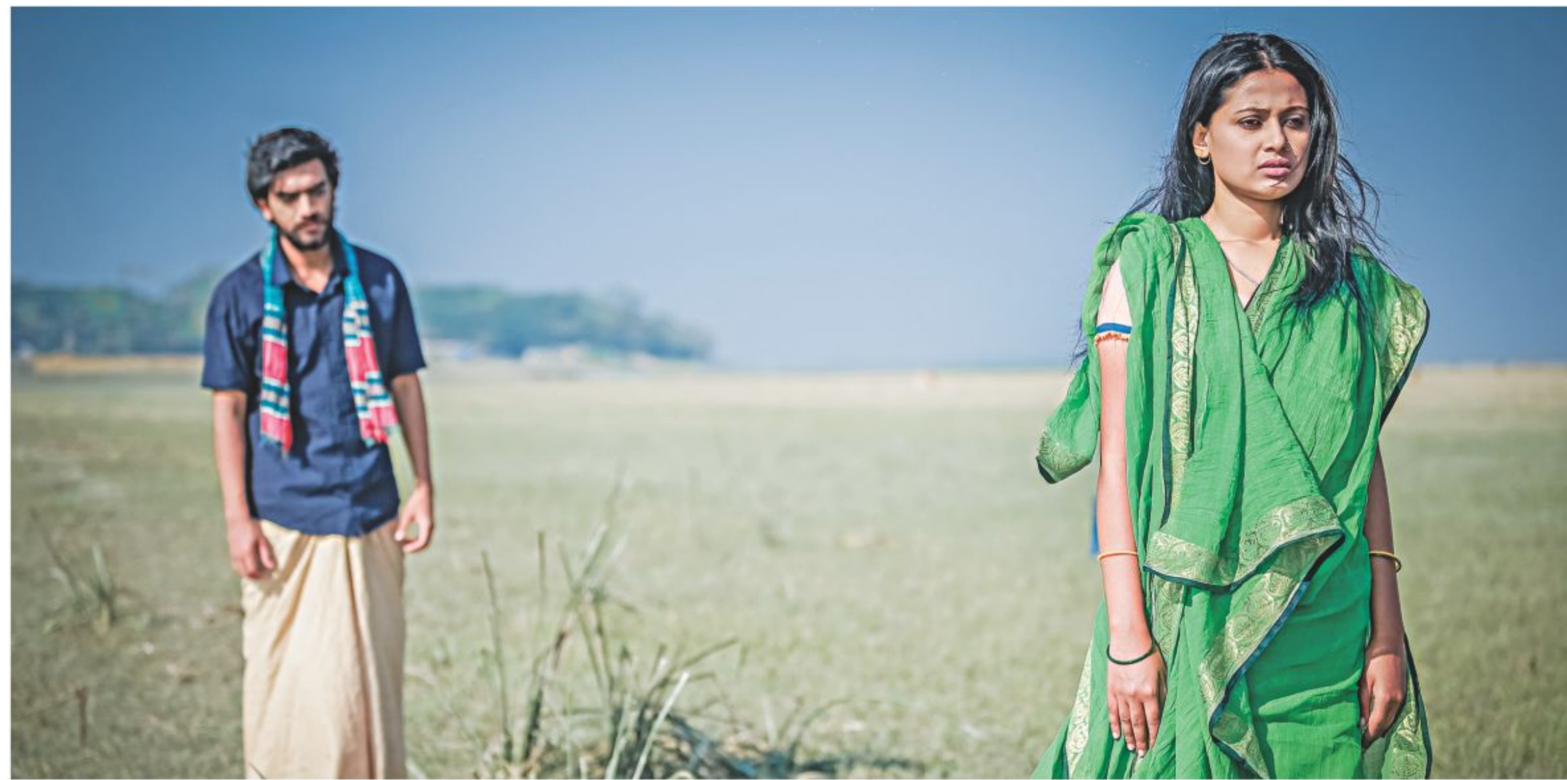
A still from the film.