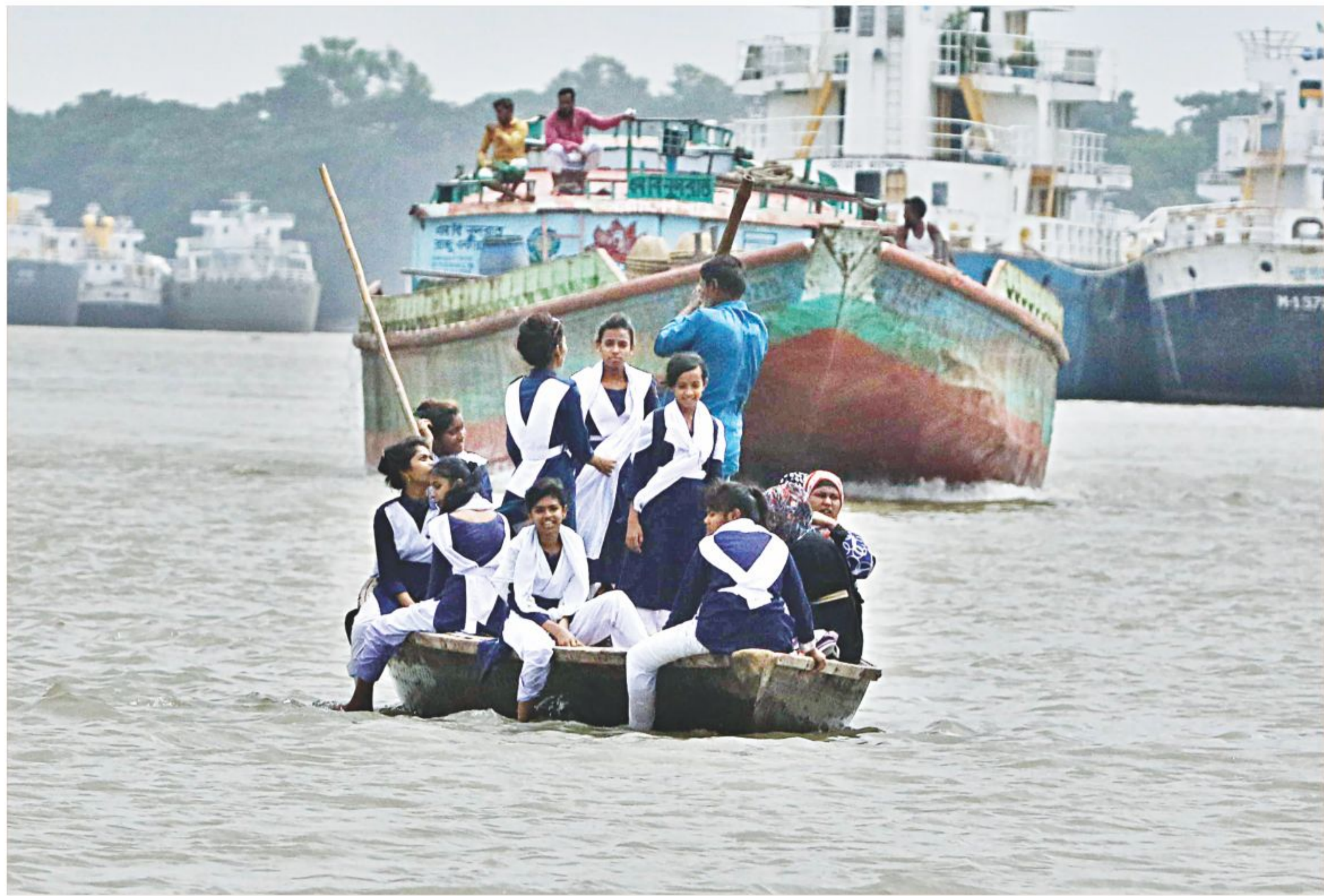
Schoolgirls take a boat in the Shitalakya in Narayanganj on Sunday while a sand-laden vessel looms dangerously close. Every day, hundreds of people use such boats to cross the river for Narayanganj city and collision with cargo vessels are not uncommon, say locals.