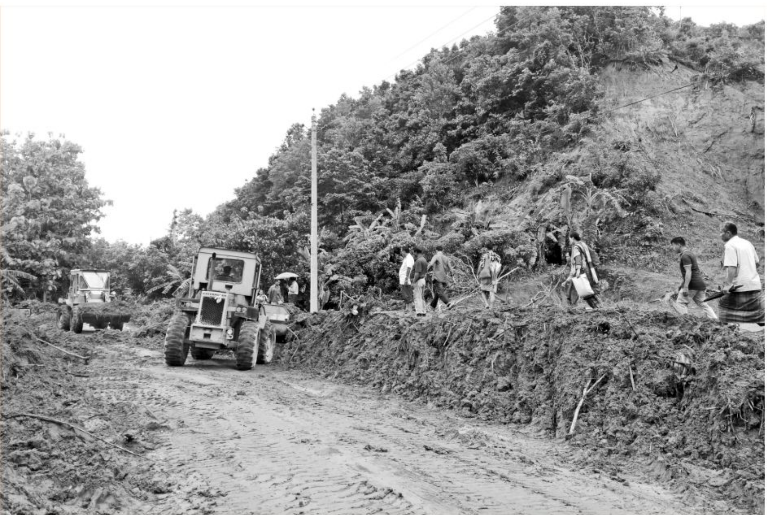
A landslide on June 13 severely damaged the Rangamati-Khagrachhari road, stopping traffic movement on the route. The photo was taken yesterday from Khamar Para area of Rangamati's Sapchhari union.