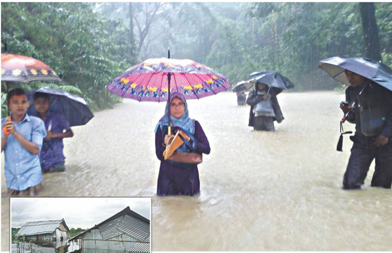
People wade through over knee-deep water on Ramu-Naikhangchhari Road yesterday afternoon as incessant rain disrupts communication in Cox's Bazar. Partially submerged homes, inset, in Kurbanpur area of Kaulura upazila of Moulvibazar yesterday.