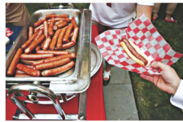
New York

Joey "Jaws" Chestnut, a competitive eater, talks like any other athlete. Conditioning is key for pushing the body to its limit, the 33-year-old Californian says. He certainly stretched that limit on Tuesday, downing 72 hot dogs and buns in 10 minutes at the annual wienner-eating contest on New York's Coney Island, a tradition that marks every Independence Day holiday in the United States. Chestnut won the competition for the 10th time and improved on the speed-eating tally he posted last summer. In the 2016 edition of the eat-fest at the Nathan's Famous beachside hot dog stand — it began way back