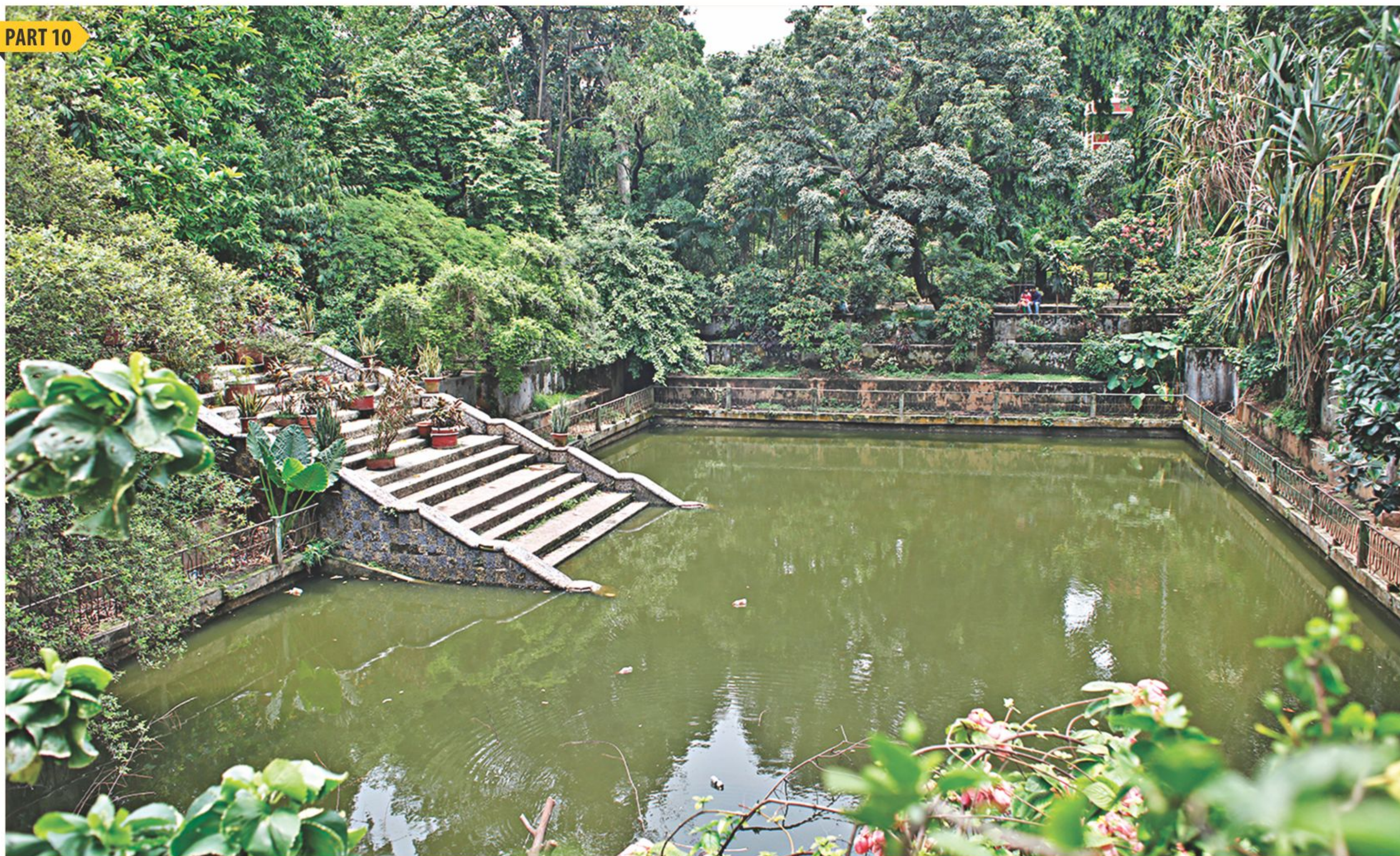
The over 100-year-old Sankhanidhi Pond inside the capital's Baldha Garden still offers a much-needed respite from the jaded city life.