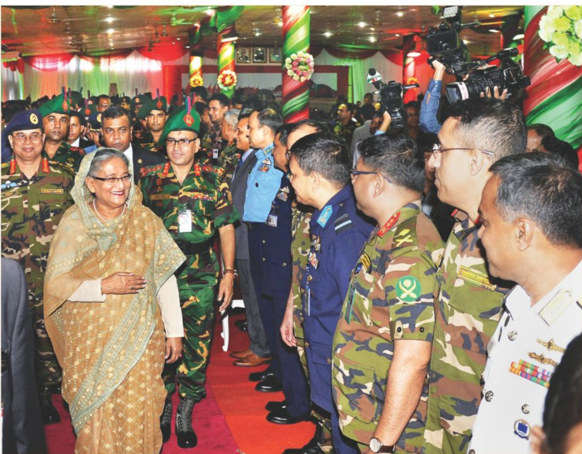
Prime Minister Sheikh Hasina exchanges pleasantries at a function marking the 42nd founding anniversary of the President Guard Regiment at its Dhaka Cantonment headquarters yesterday.