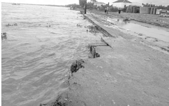
The under-construction flood protection embankment in Chowhali upazila of Sirajganj was damaged due to erosion by the Jamuna river.

Refuting the allegation of poor construction work, the WDB engineer said a technical survey showed that the soil is too weak to bear the weight of the embankment. A technical committee is likely to be formed to find out a way to permanently protect the embankment, Shajahan added.