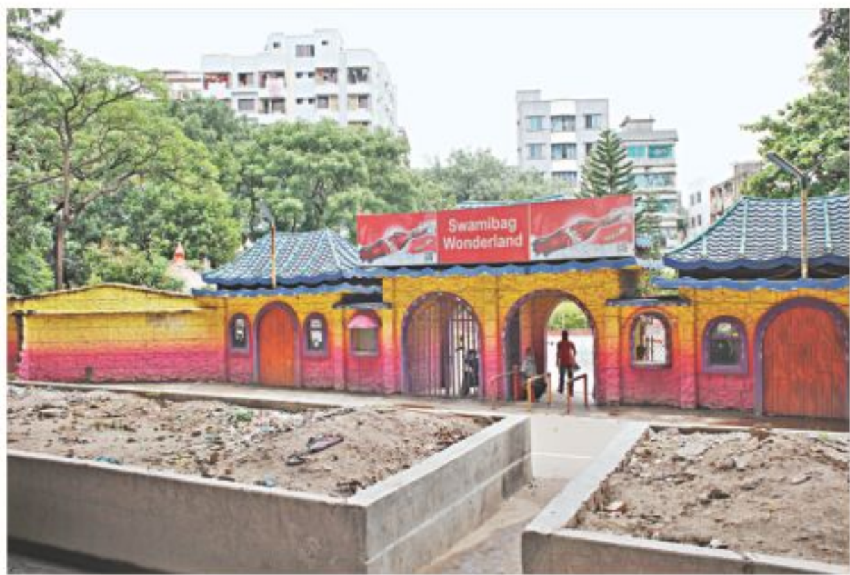
The pond replaced by an amusement park in Koratitola.

Once Ward-76 of the undivided Dhaka City Corporation (DCC) was full of ponds, providing a much-needed breathing space for the residents. Due to negligence of the authorities concerned, most of the water bodies of the 0.548 sq km ward (now Ward-40 of Dhaka South City Corporation) were filled up at different times. According to a survey carried out in 2006 by the DCC, there were only two ponds in the area. While talking to the residents of the ward including Tikatuly, Narinda, Koratitola and Swamibagh areas, they said there were two more ponds that got replaced by an amusement park and a school. The water bodies were filled up before the DCC survey, they added. ISLAM SHAHEBER PUKUR The around 1.75-bigha pond on KM Das Lane in Tikatuly of Old Dhaka used to be surrounded by banyan and mango trees. Now, not even a fleeting glimpse of