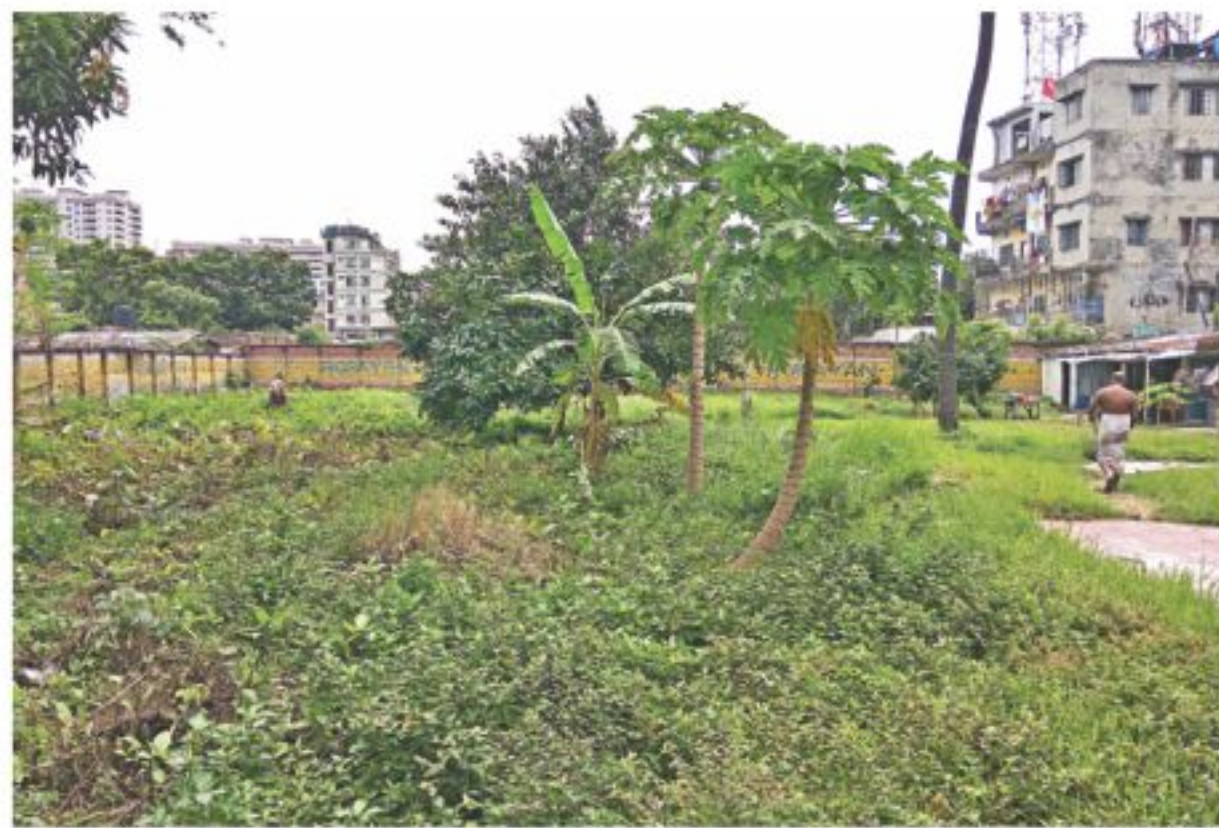
Islam Shaheber Pukur is filled up completely.