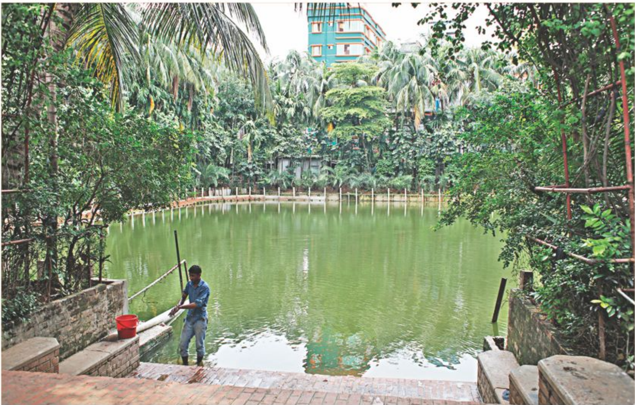
Mitali School Pond is now a playground. The pond inside St Joseph School of Industrial Trades is still properly maintained.