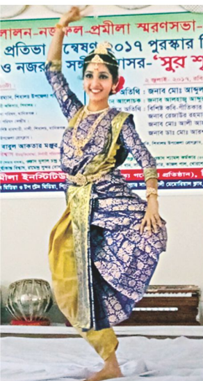
A young dancer performs at the event.