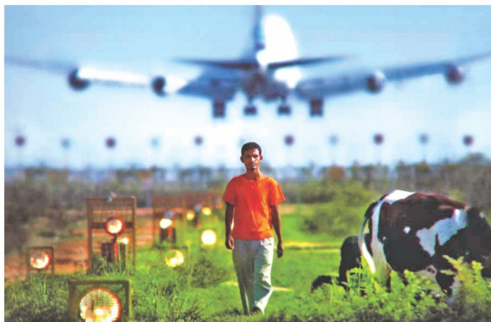
A still from Tareque Masud's "Runway", which was screened at the festival.