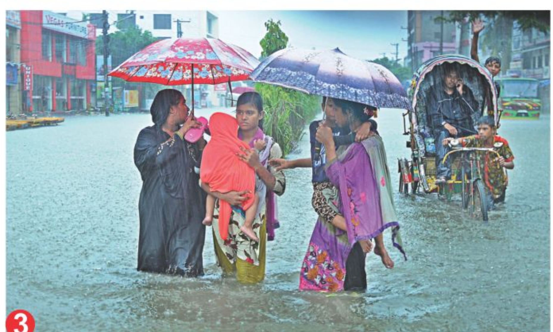
A CITY IN DISARRAY... The residents of country's second largest city, Chittagong, yet again faced the same situation they had been facing for years -- waterlogging. Their livelihood ground to a halt yesterday -- fifth time over the past three months -- following nearly 12 hours of monsoon rain. The heavy rain started at midnight on Sunday and stopped yesterday afternoon. The commuters and others out on the roads had to face immense sufferings due to shortage of operable transport in most parts of the city. The photos of inundated city roads were taken in Sholoshahar (1), Probertak (2) and Agrabad (3) areas.