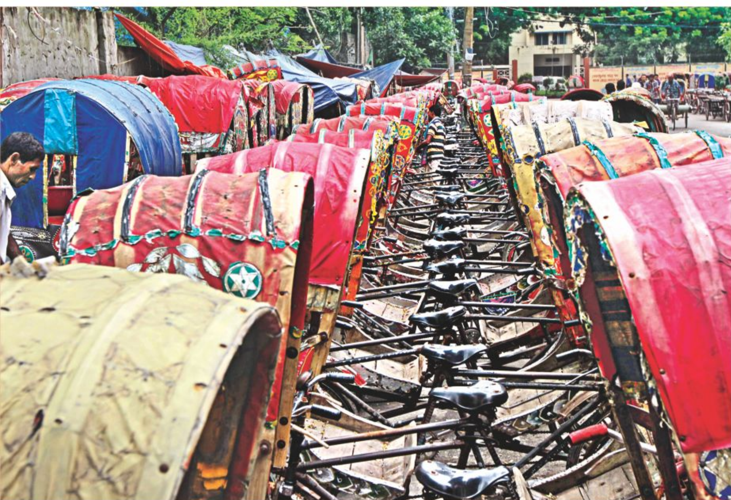
Rickshaws are kept by grabbing an entire footpath and some portions of a road in the capital's Tejgaon. The authorities concerned apparently turned a blind eye to such a malpractice that is becoming common in the city. The photo was taken on Saturday.