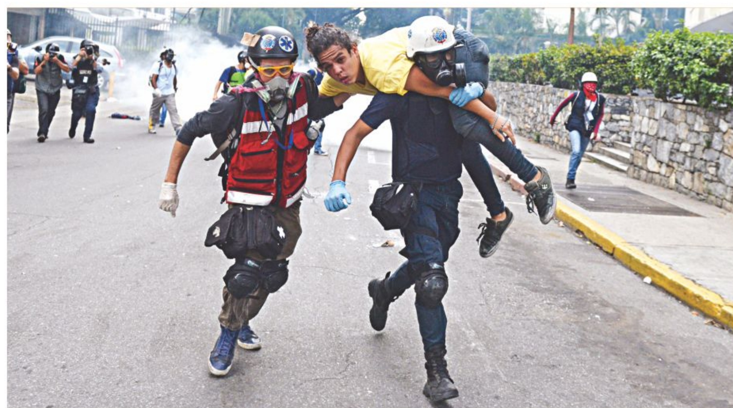
An injured opposition activist is taken away by volunteer medics during protest against the government of President Nicolas Maduro, at the Francisco Fajardo highway in Caracas, on Saturday. Venezuela marks three months of violent protests within a political and economic crisis with protesters demanding President Nicolas Maduro's resignation and new elections.

It underscored rising insecurity in the war-torn country as the resurgent Taliban step up their assaults, with government forces struggling to contain them.