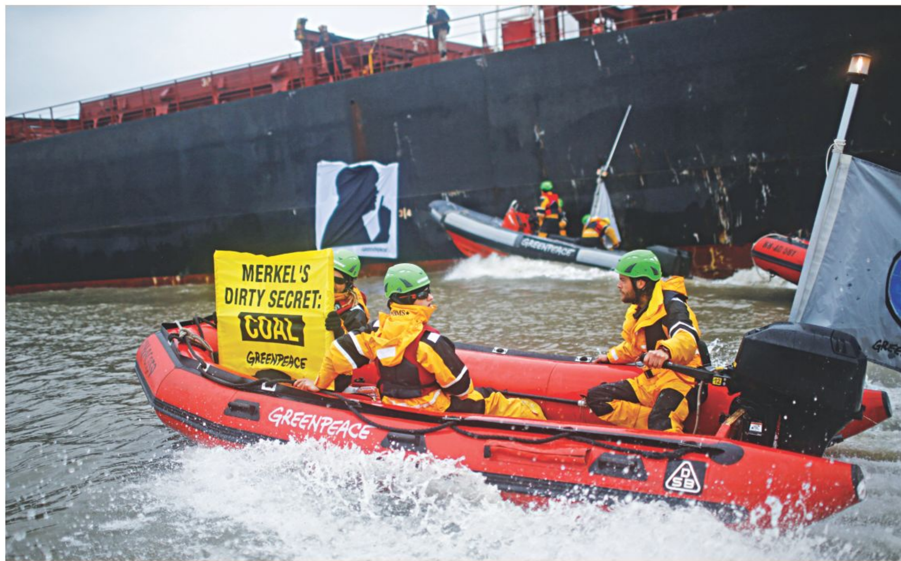
Greenpeace activists ride along a banner with a silhouette of German Chancellor Angela Merkel onto the Golden Opportunity ship carrying coal as part of protests ahead of the upcoming G20 summit, in Hamburg Harbour, Germany, yesterday.

A huge power outage plunged millions of people across Central America into darkness Saturday, as authorities from Panama to Costa Rica to El Salvador scrambled to restore electrical service. The blackout affected some five million people in Costa Rica alone, where officials largely had managed to restore service after a nationwide power outage lasting about five hours.