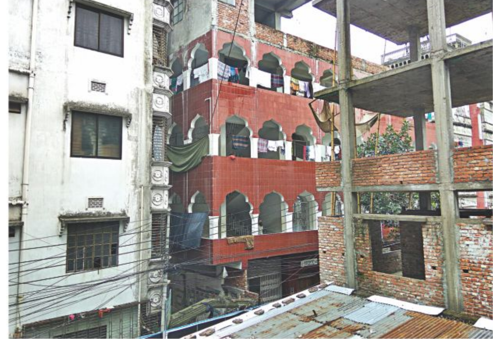
Chhapra Masjid Pukur replaced by buildings.