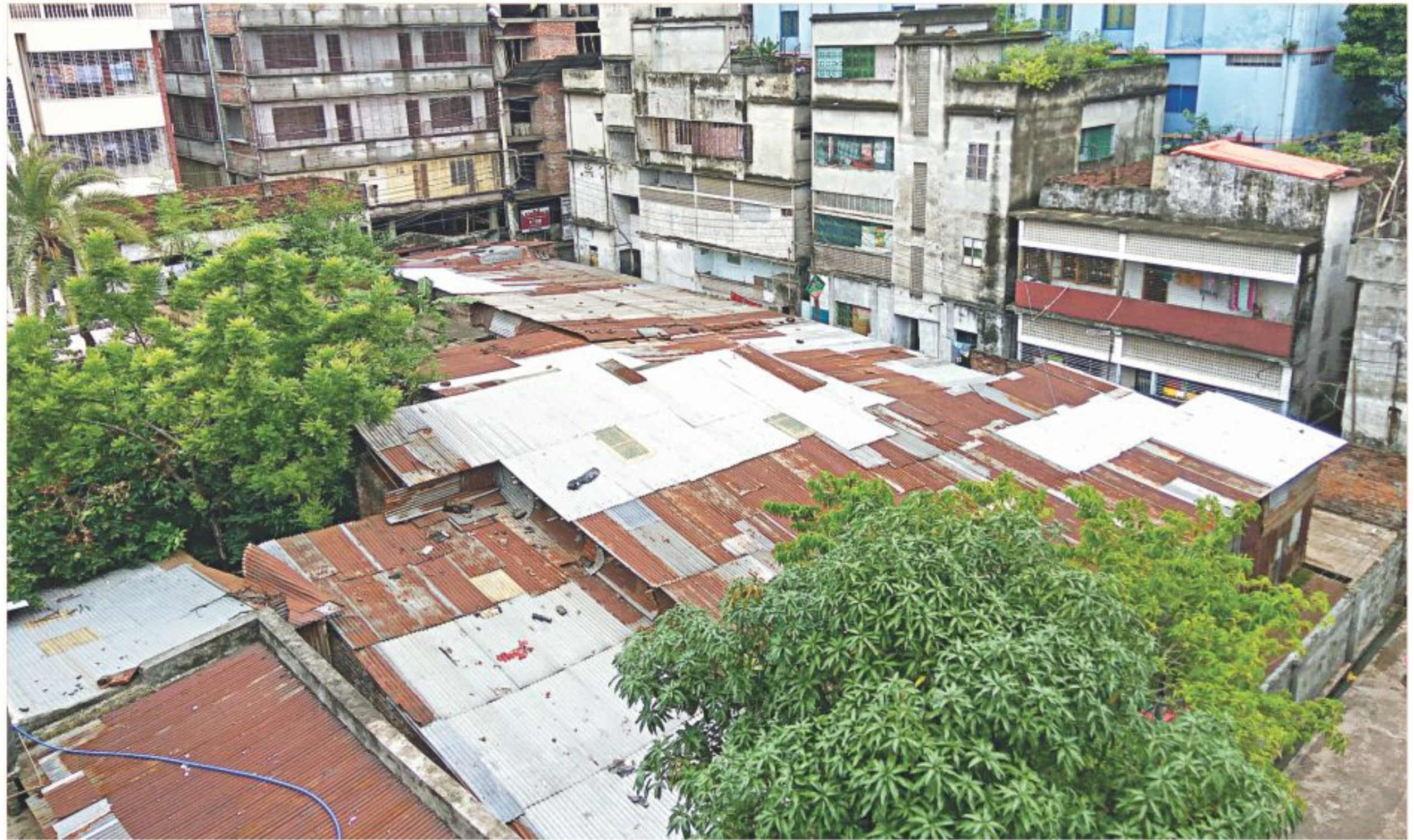
Shops and makeshift structures occupy what once was Ekram Shaheber Pukur.