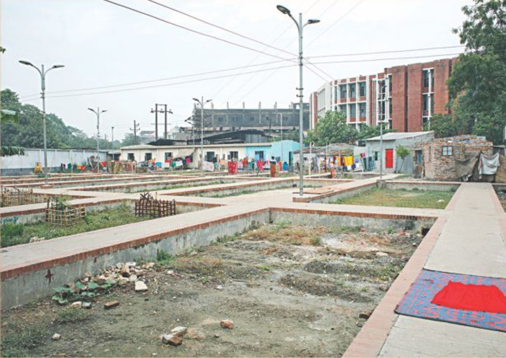
Postogola Cremation Ghat Pukur has become a cremation ground.

Of the remaining two, one is barely surviving due to the negligence of the authorities concerned. The other one is still in a relatively better condition. Among the six, two were on the DCC base map where DCC mentioned that the ponds belonged to them. However, both have now disappeared due to a lack of protection. The around 0.576 sq km ward comprises Gandaria, Postogola, Lal Mohan Poddar Lane, Dhaka Cotton Mills, Bangladesh Bank Colony and Dhaka Nagar Lane of Sutrapur among other areas. It now falls under Ward-47 of Dhaka South City Corporation.