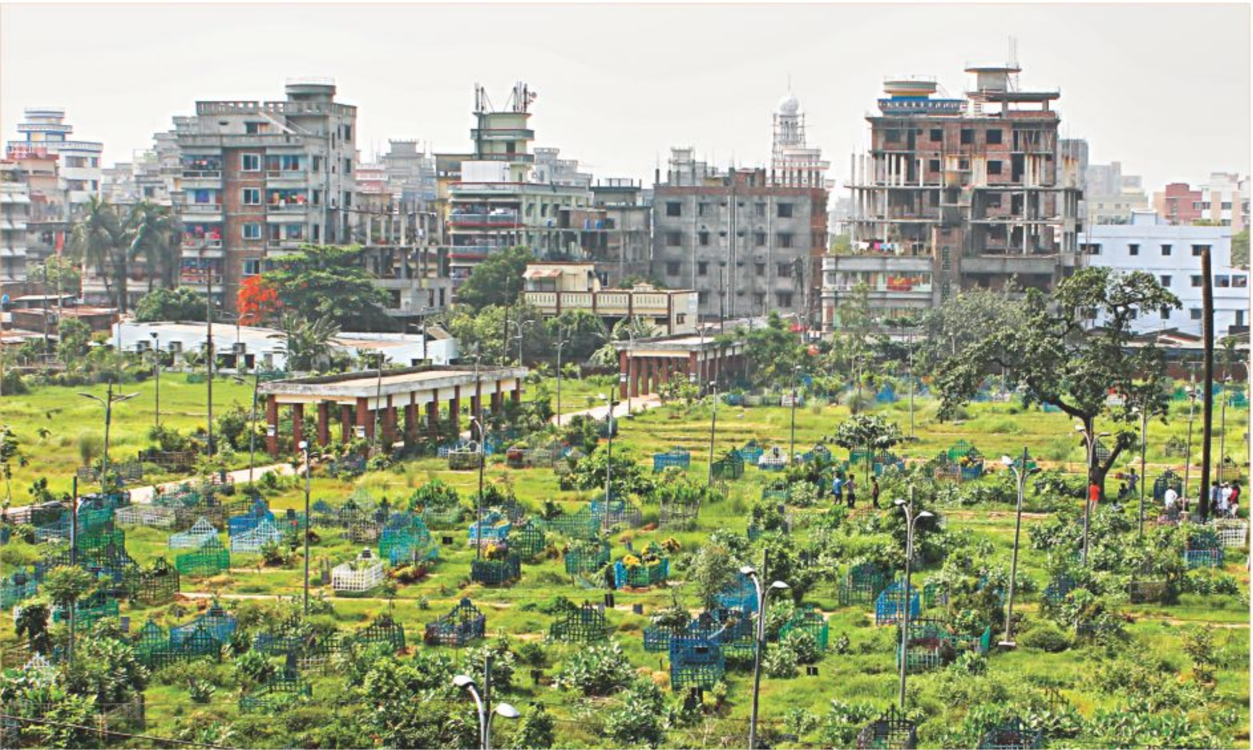
The pond at Jurain graveyard has been filled up for extending the graveyard.