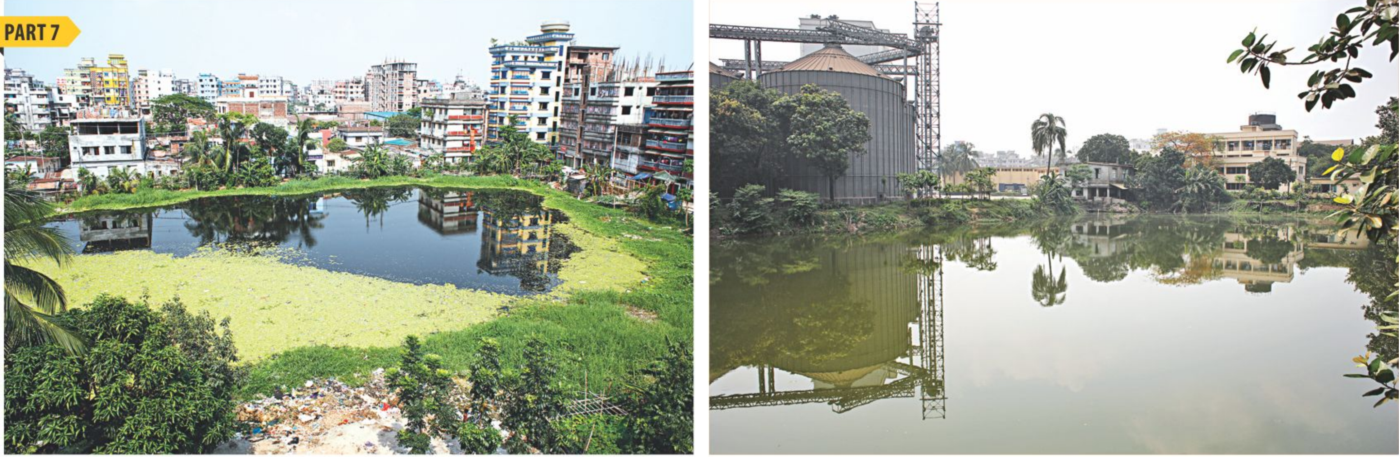
Gandaria Pond under a constant threat of encroachment and pollution. A soothing Govt Modern Flour Mill Pond remains protected.

Once Dhaka was adorned with several hundred ponds. Like canals, only a handful exist now. But they are also in death throes due to negligence of the authorities concerned. Although, according to the Field, Open Space, Park and Natural Water Body Protection Act 2000, filling up of any water body including pond is illegal, it's going on unabated. The Daily Star found 63 ponds in the maps of undivided Dhaka City Corporation (DCC) in its 28 wards out of 90. A survey for the map was carried out between 2003 and 2011. But many of the water bodies were filled up before the period and also even after the survey. We are publishing the seventh report of the series today covering the then DCC ward-83, which is now ward-47 of the Dhaka South City Corporation.