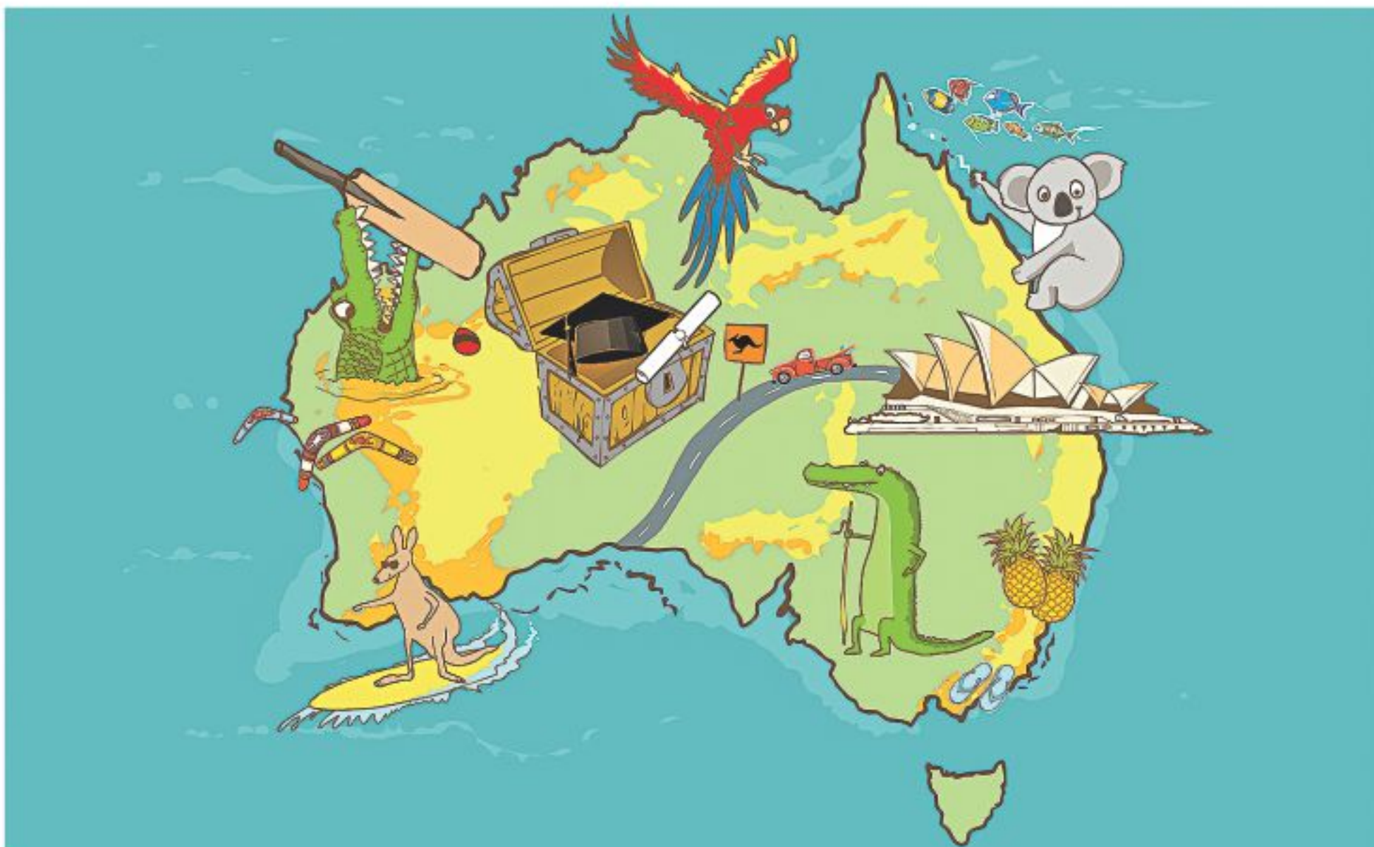
ILLUSTRATION: EHSANUR RAZA RONNY

There is also the option of migrating permanently through the skilled worker stream. Students can check whether their subject of choice is listed in the Skilled Occupation List (SOL) of the Australian government. Once you are sure it is, you have to ensure that you can accumulate at least 60 points to be eligible to apply for an invitation to apply for Permanent Residency (PR). Yes, you cannot apply for a PR straightaway. Once you meet the requirements, you have to submit an Expression of Interest (EOI). Based on the