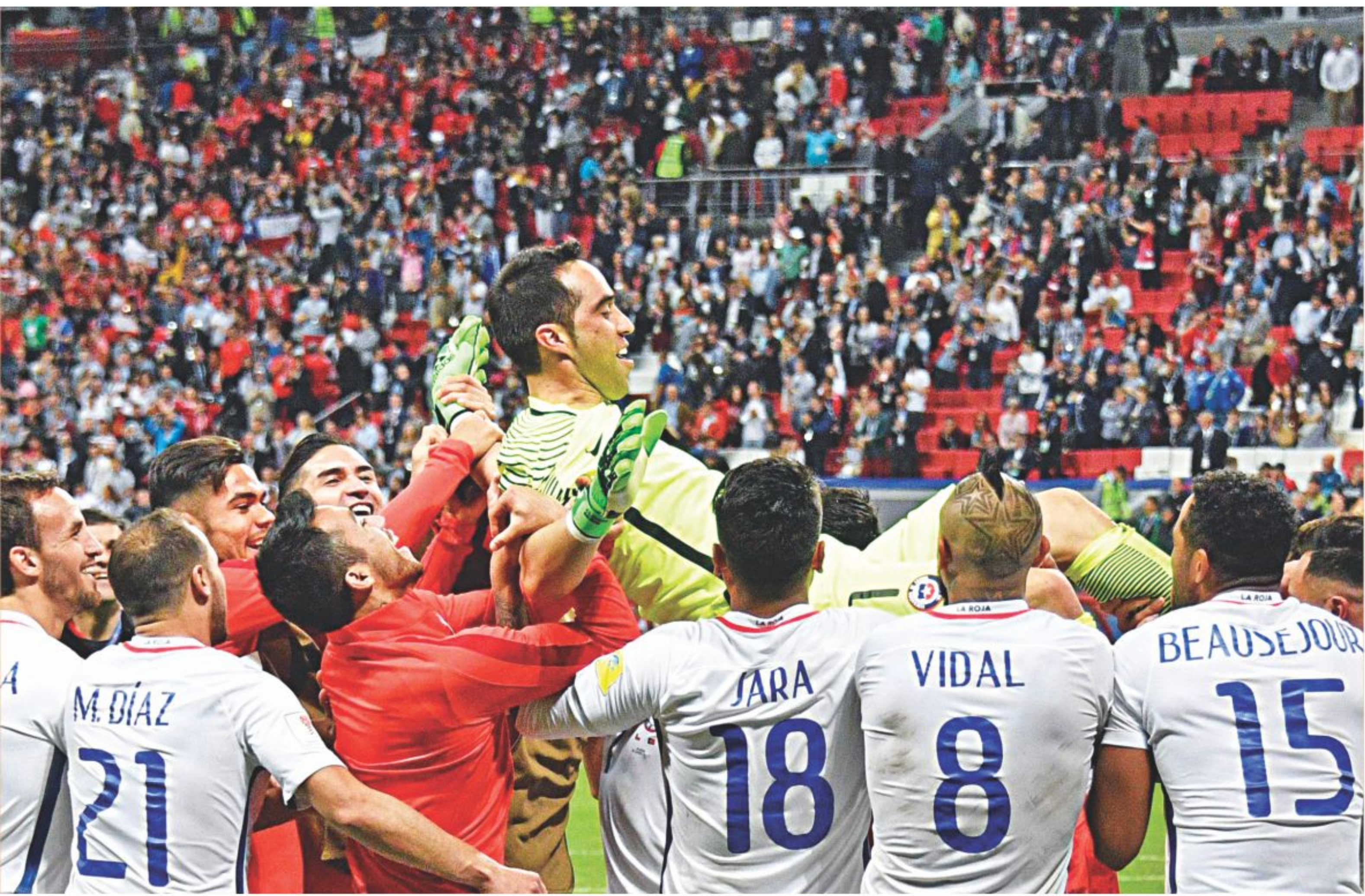
Chile goalkeeper Claudio Bravo is lifted in the air by his teammates after his heroics in the penalty shootout won them the Confederations Cup semifinal against Portugal at the Kazan Arena on Wednesday.