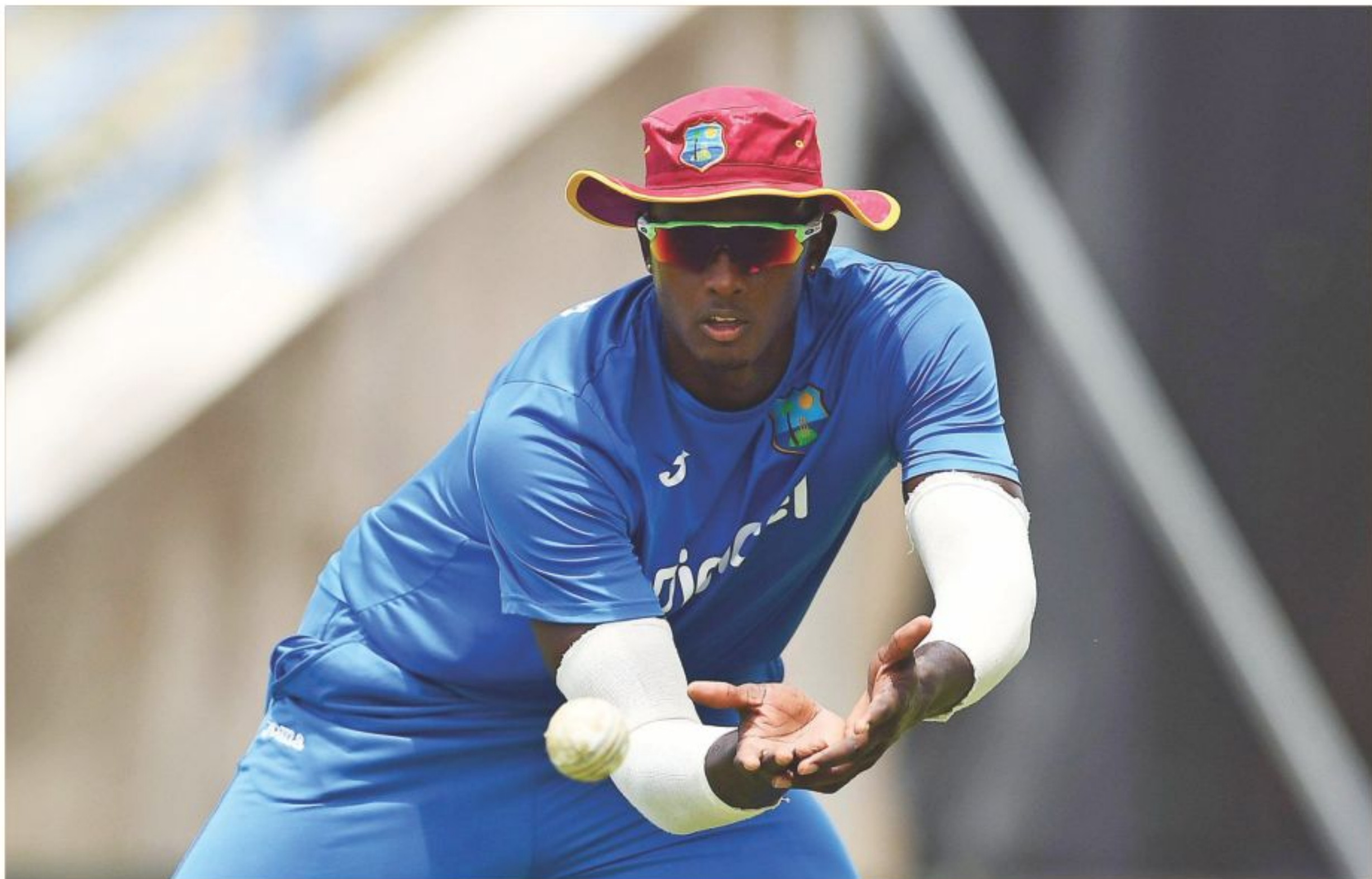
West Indies captain Jason Holder catches a ball during a practice session at the Sir Vivian Richards Cricket Ground in Antigua ahead of today's third ODI against India.