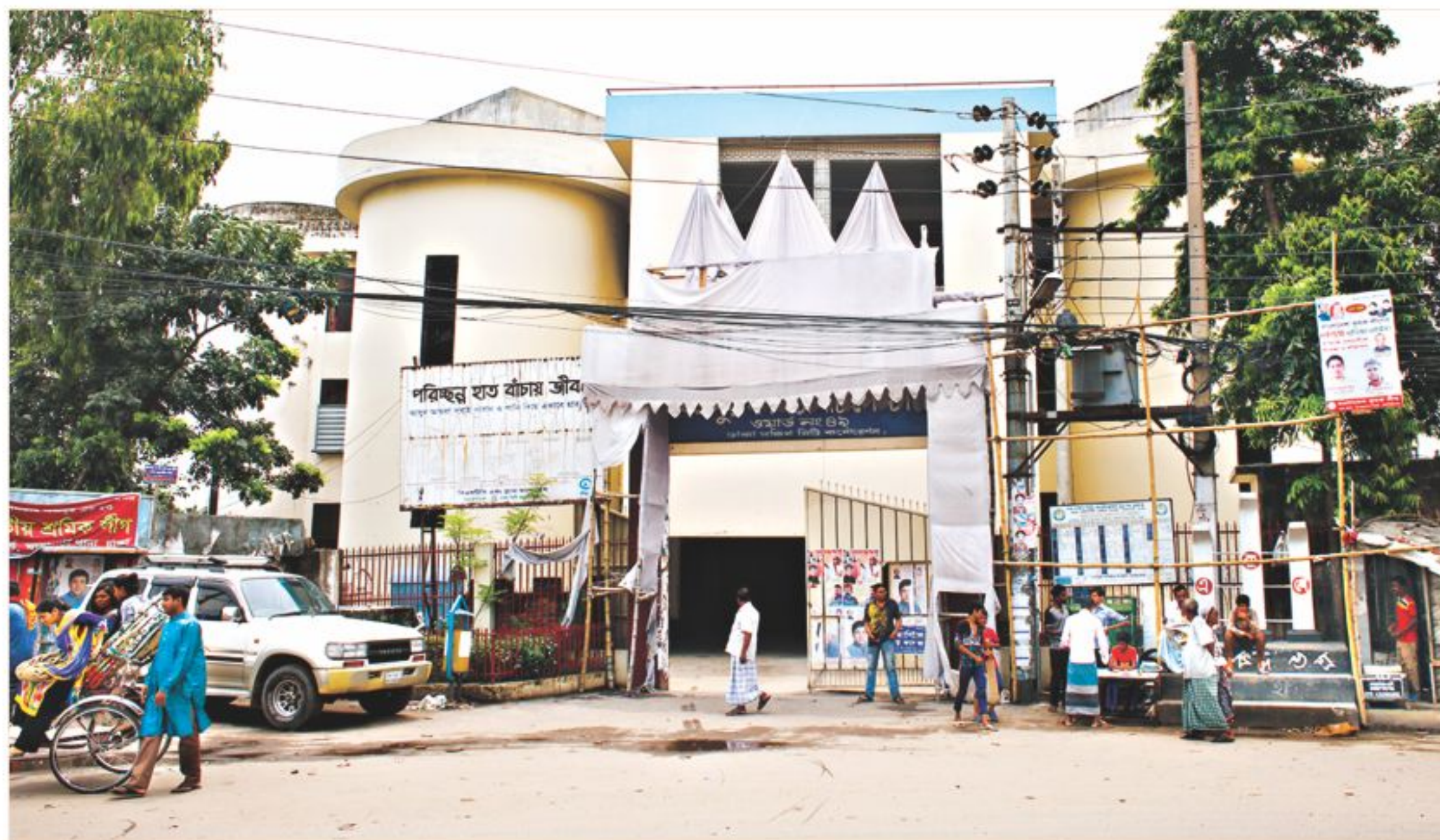
Dhalpur Pond has been filled up to make way for a community centre.