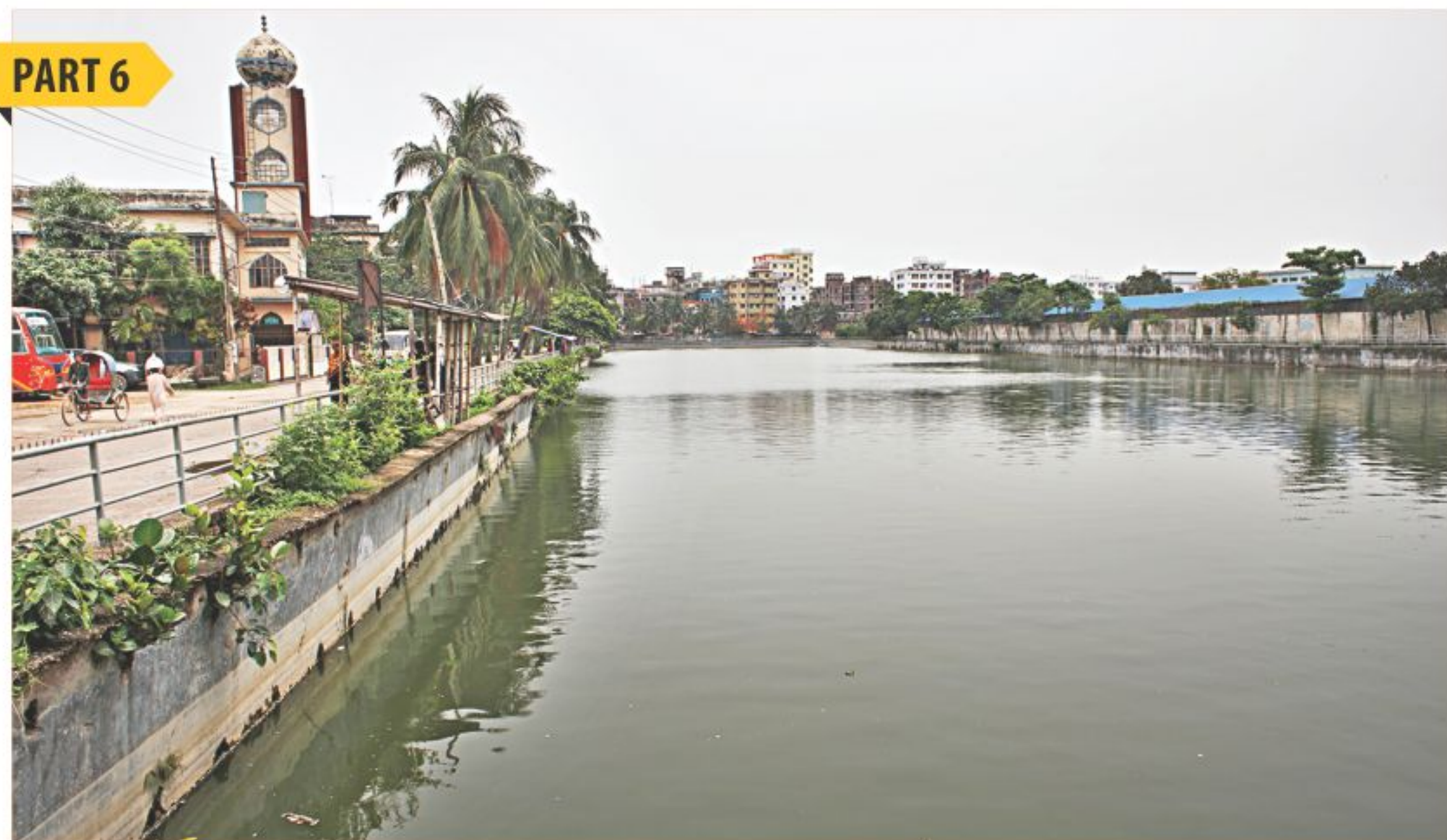
Outfall Staff Quarter Pond continues to offer people a much-needed breathing space.