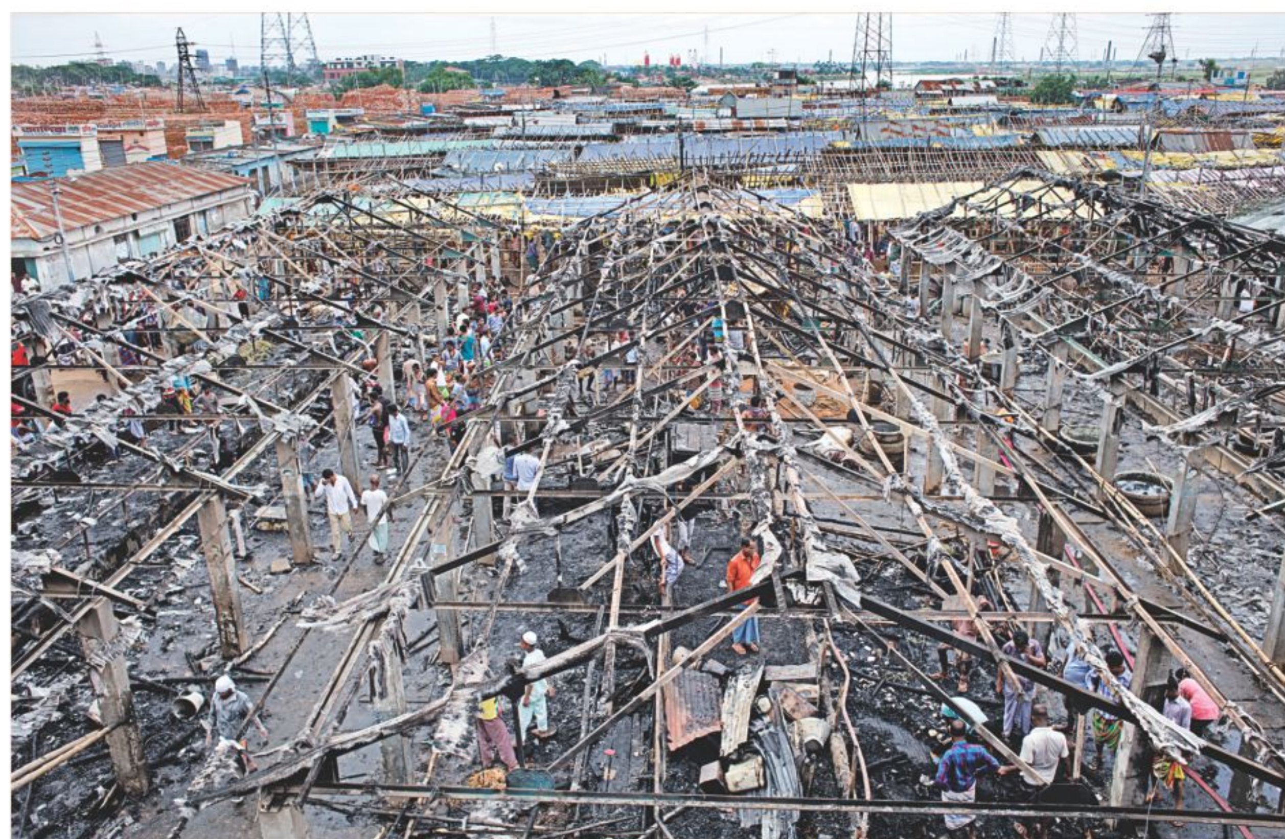
The damaged Gabtoli cattle market in the capital yesterday.

"We tried to untie the animals... But it was almost impossible as the fire created severe heat and the plastic was melting down on us," he said.